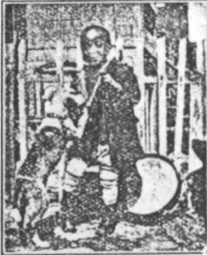
THE DRUMMER BOY AND HIS DOG

A book that will help the most prominent member of society or the most humble.