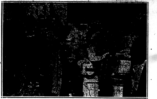
Relief workers satisfying the needs of the storm stricken. Food and clothes are needed.