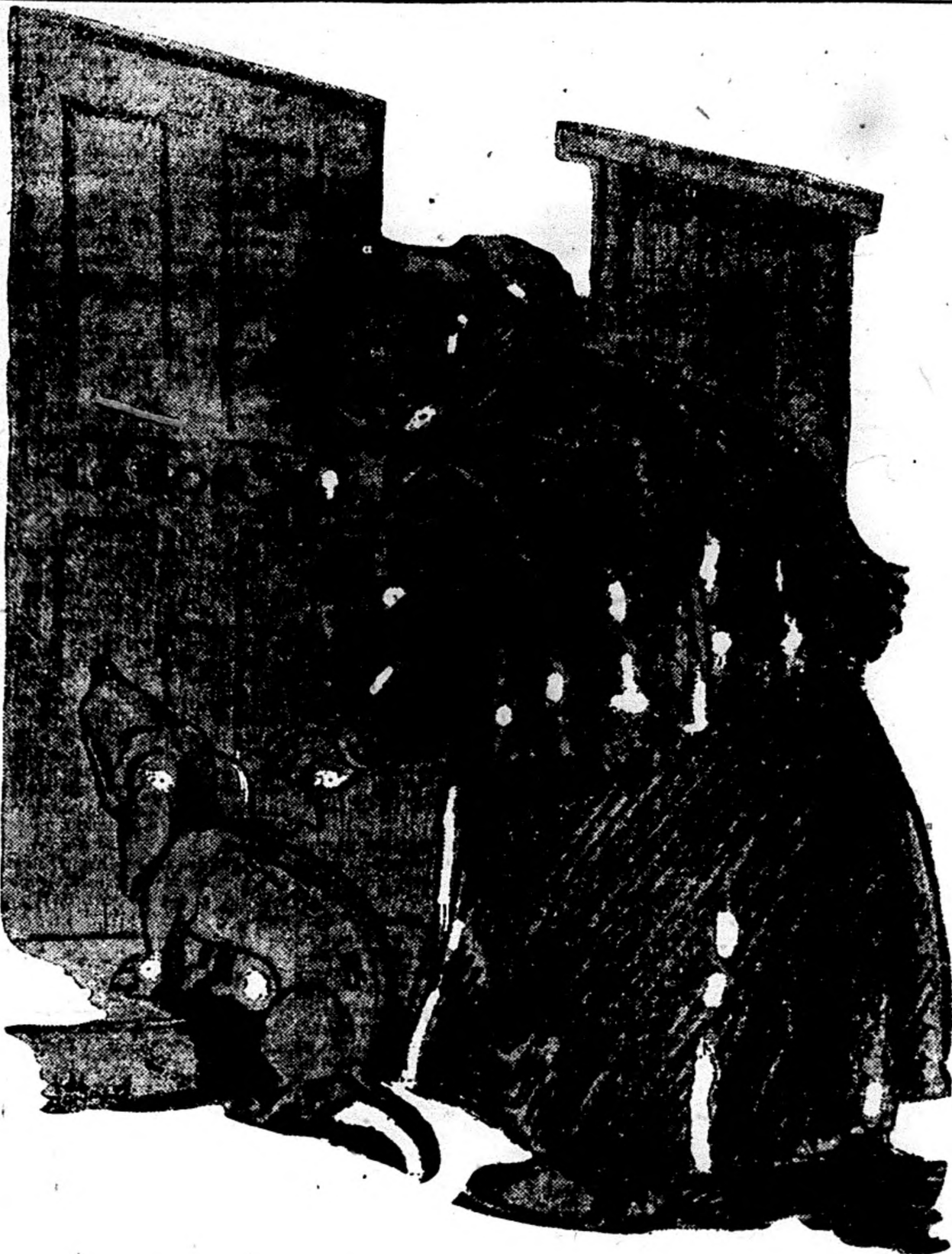
Communist Education Kicks This Hound Out.

Science and upon the eve of the convention, refused affiliation to the Workers' School which for the past two years has been conducting a true working class education with a student body numbering several hundred.