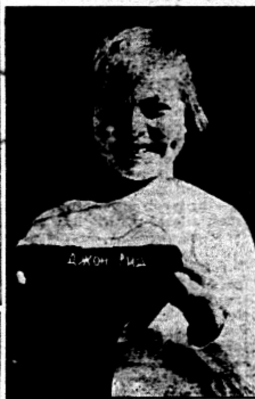
This is a member of the John Reed Pioneer group of Soviet Russia. The youngster is proudly exhibiting the name of the group, John Reed, which they wear on their caps.

In the United States, in the city of Chicago, there is also a John Reed Junior group functioning quite successfully. To celebrate the first anniversary of their organization the group is giving a surprise party and dance, Saturday eve., May 23, at the Workers' Home, 1902 W. Division St. There will be an interesting program for children and for adults. They promise something new in entertainments. Besides that, there is a surprise. Admission for children will be 10 cents and for adults 20 cents.