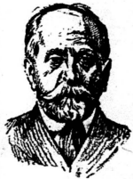
S. F. OLDENBURG Secretary of the Academy of Science

MOSCOW, Sept. 12.—(By Mail).—Lunacharsky, people's commissary of education, addressing the Academy of Sciences recalled that moment when just in the beginning of the revolution of Nov. 7, the academy being faithful to the spirit of the time declared its readiness to work on scientific problems jointly with the Soviet government.