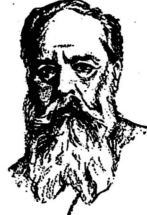
V. A. STEKLOV Vice-Pres. of the Academy of Science

The first experiments in electricity, recently discovered by Franklin, were also made by Lomonosov, who discovered the effect of ascending and descending currents upon the development of electricity in the atmosphere, pointing out their importance in meteorology. He was first in appreciating the importance of lightning-conductors and in expressing the idea of the aurora borealis being due to electrical force. He began a great work