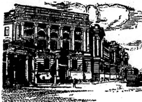
General view of the Academy of Science of the U. S. S. R. at Leningrad.

on The Theory of Electricity treated in mathematical terms.