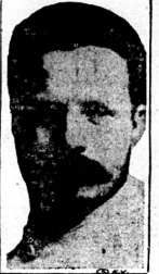
MIKHAIL FRUNZE Commander-in-Chief of the Red Army

At the beginning of 1905, Frunze worked in Moscow, then in the Ivanovo-Voznesensk factory in Vladimir. During the party splits in Moscow and Petrograd, he took a decidedly liberal side of the Leninists. In December, 1905, he took part in the insurrection at Moscow. In 1906, as a delegate from the committee of Voznesensk, he participated in the Third and Fourth Congresses of the party at Stockholm. In 1907, he was arrested at Moscow where he had been working under the name of Arseno, and sentenced to a long term of imprisonment. Drot before the magistrates for belonging to