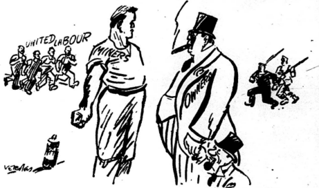
The above cartoon is from the London Sunday Worker and depicts the stubborn fighting spirit which now characterizes the British working class—and is causing sleepless nights for the bosses

ates a great danger for the British capitalists. It brings into motion huge masses of workers and British capitalism has changed its tactics—it attacks now only the most advanced section of the working class, hoping to cut it off before the reserves arrive. And, as every battle is decided by the reserves, if we subscribe to the military formula, we must admit that the idea of empire has forced its action in Great Britain depends largely upon how fast the huge reserves of the working class can be brot into action.