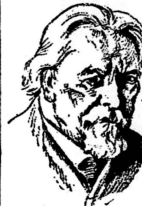
M. KARPINSKY President of the Academy of Science

If you want to thoroughly understand Communism—study it.