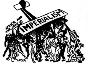
"The hour of liberation of North Africa and Arabia from the rule of French, English and Italian imperialism is near at hand."

military machine ordered dispersal of the street crowds. With the most savage fury the troops assailed the Syrians. Twenty-five thousand of them were murdered in two weeks. As a means of intimidating the inhabitants the troops strapped dead bodies of their victims on camels and paraded them thru the streets of Damascus. Instead of inspiring terror, these acts aroused the fury of the masses. Street fighting began. Terrific carnage ensued. For more than fifty hours the city was a veritable inferno. Machine guns, hand-grenades, poison gas, airplane bombs, armoured cars and tanks, all the equipment of modern warfare was brought into action against the population of the city. Damascus was subdued. In the smoldering ruins the uniformed French soldiers thoughtlessly prowled among the dead, stealing jewelry and other valuables, even cutting off the hands and feet of their victims because it requires too much work to attempt to remove the jewels.