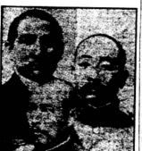
Sun Yat Sen, Tchang Tu Lin, and Wu Pei Fu.

That a fundamental settlement of the problems involved can be arrived at is not possible. The creation of a developing so swiftly with the world capitalist system, now that it is retrospective, are too great to be solved except by the total annihilation of the latter way extends the ominous figure of the Soviet Union—on whom for the oppressors of the people. The arm with his peasant brother, fall on the startled faces of the diplomats who plunged the world in one bath of human blood and stain. It is to depictate a second or at least, unable to prevent one.