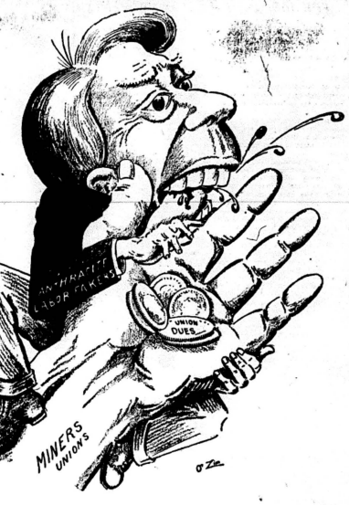
Instead the coal miners must make the union officials—their servants—do their bidding.