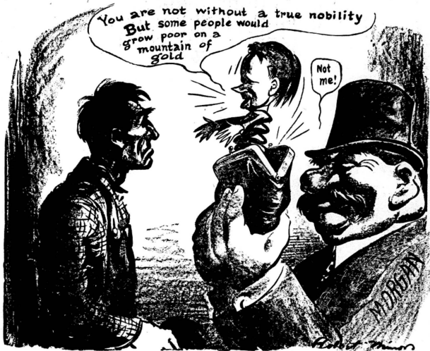
Mr. Morgan's Mr. Coolidge informs the Farmers that Nothing Can Be Done About It Under Democracy.