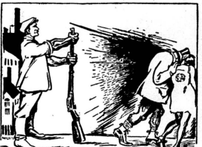
"BANISHED FROM PARADISE"—Our Own Version of a Bible Lesson from "Gudek," published in Moscow.

A few months after this affair the fierce police captain was shot and killed in the center of the city. He had a mounted policeman as a body guard, but the latter ran away as soon as the firing began.