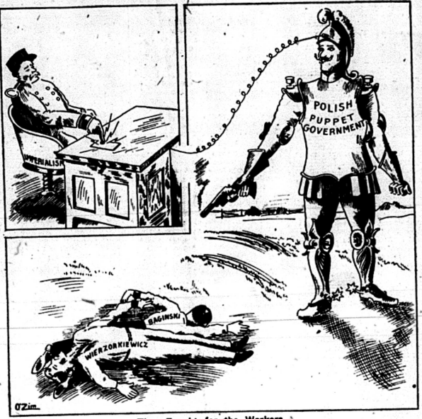
They Fought for the Workers.