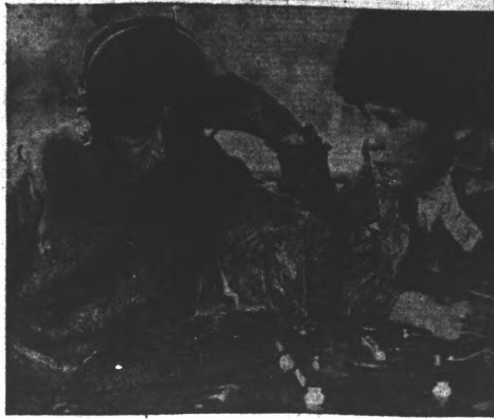
Science Comes to the Peasant—the Radio.

The proletariat fights from the beginning for hegemony in the sphere of social and political relations, it fights for the consolidation of its leadership over the toilers against the