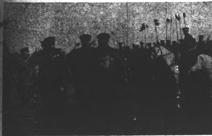
Famous Red Cavalry Commander Budenny (in front, left), inspecting Red Troops.