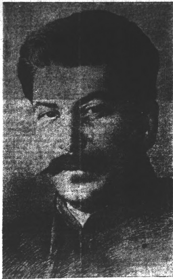
JOSEPH V. STALIN

What does the "horror" in the regime consist of which is so hated by