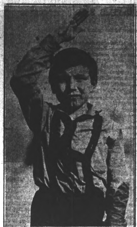
The Young Pioneer

The peasant youth school, the agricultural circles, the cooperative training courses for peasant boys and girls, the peasant courses of Soviet officials, these are the fundamental