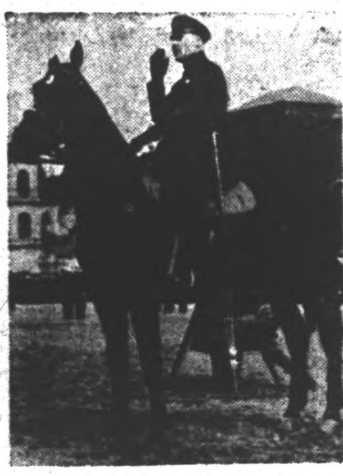
Vasilyevich, Red Commander in Moscow.