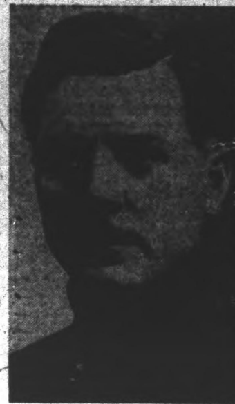
CLEMENT VOROSHILOV People's Commissar of War.

The letters written home form a link between the backward village and the modern city. And when