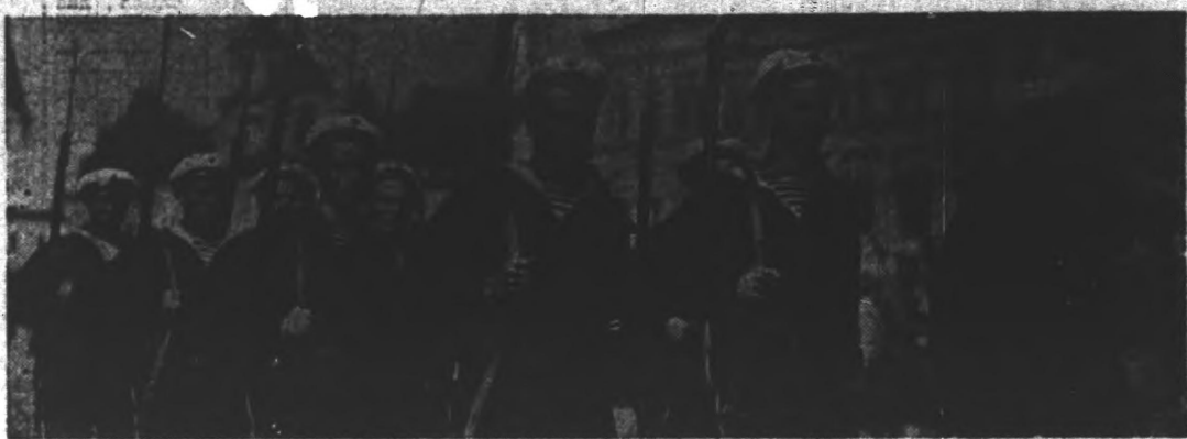
Detachment of Red Sailors, Pride of the Revolution.

Receiving but a modest wage, Red Soldiers serving under the regular system, that is a period of from one and a half to ten years or more in the