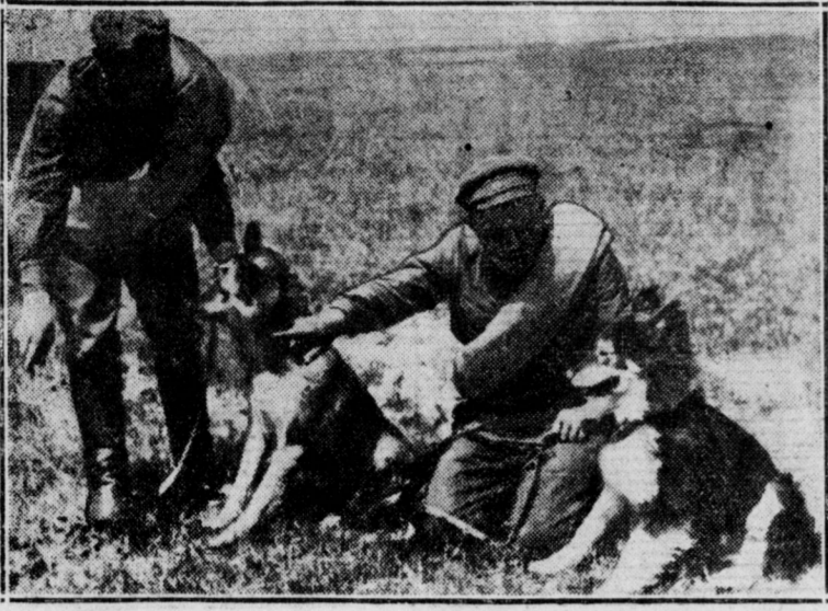
The workers and peasants of the Soviet Union are for peace, but are ready to defend the workers' fatherland at any time.