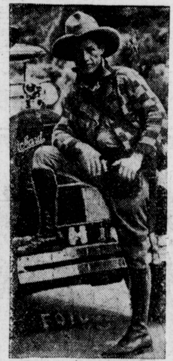
General Augusto Sandino, leader of the Nicaraguan workers and peasants in their fight on the Wall Street imperialist troops and the Wall Street puppet government in Nicaragua. The above photo was taken in Mexico where Sandino recently arrived to enlist the active support of the Mexican workers and peasants in the fight against the imperialists. The workers and peasants are continuing the struggle against Wall Street.