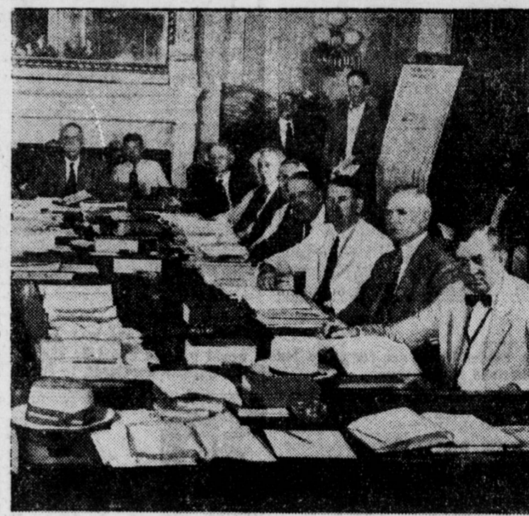
Photo shows the senate finance committee meeting to fix the tariff increases. The senators were lavish indeed to big business, for example, Reed Smoot, who is chairman of the senate committee, and also has large interests in the beet sugar plantations of Utah and Idaho, fought for a tariff raise on cane sugar, which meant a benefit of many millions for Smoot and the beet sugar interests.