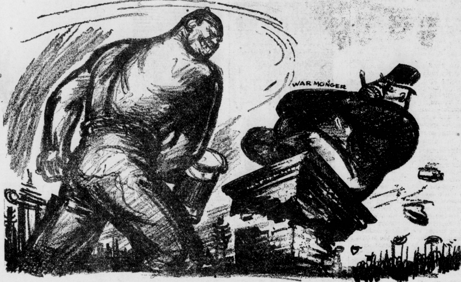
From Rote Fahne (Red Flag), Berlin.

Throughout the whole world the revolutionary workers are preparing to make on August first a mighty international demonstration against imperialism. Even during the World War the revolutionary workers demonstrated in August as a protest against the bloody slaughter on the battlefields and to make known their desire for a revolutionary termination of the imperialist war. After the war, the August demonstrations of the proletariat became ever greater and more widespread. Their slogans also became ever clearer in measure as pacifist illusions were destroyed by the aggressive war policy of the imperialist states.