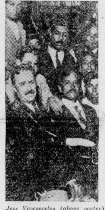
Jose Vasconcelos (above, center), former minister in the Obregon cabinet, aims to serve Wall Street as its puppet ruler in Mexico, but the Gil government seems to have gotten the Wall Street O.K. Vasconcelos will oppose the Gil candidate as the "anti-re-electionist" candidate.