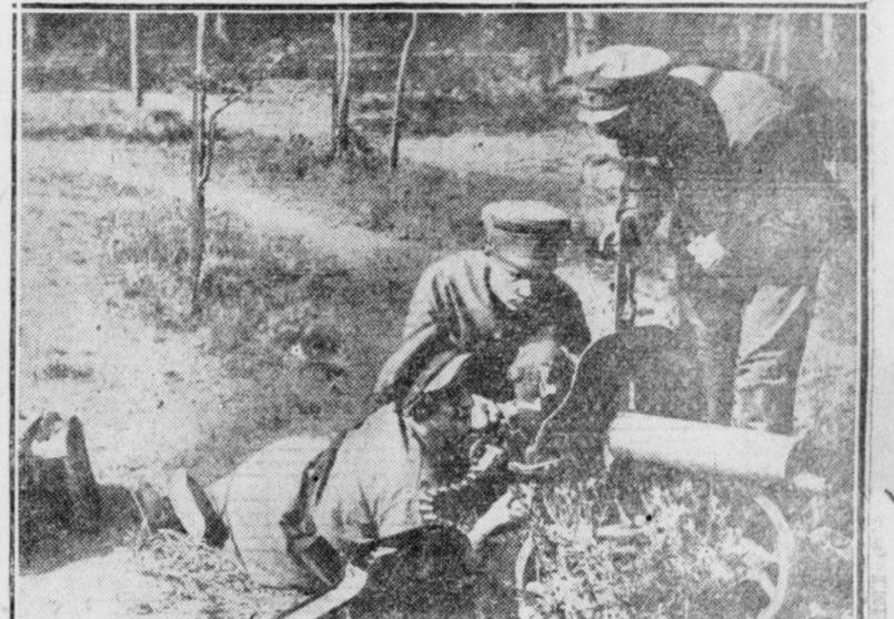
Second photo, workers taking part in military training. These workers have offered their services to defend the U. S. S. R. At right, machine gun detachments of the Red Army.

THE DAILY WORKER FIGHTS For a Workers-Farmers Government To Organize the Unorganized Against Imperialist War For the 40-Hour Week