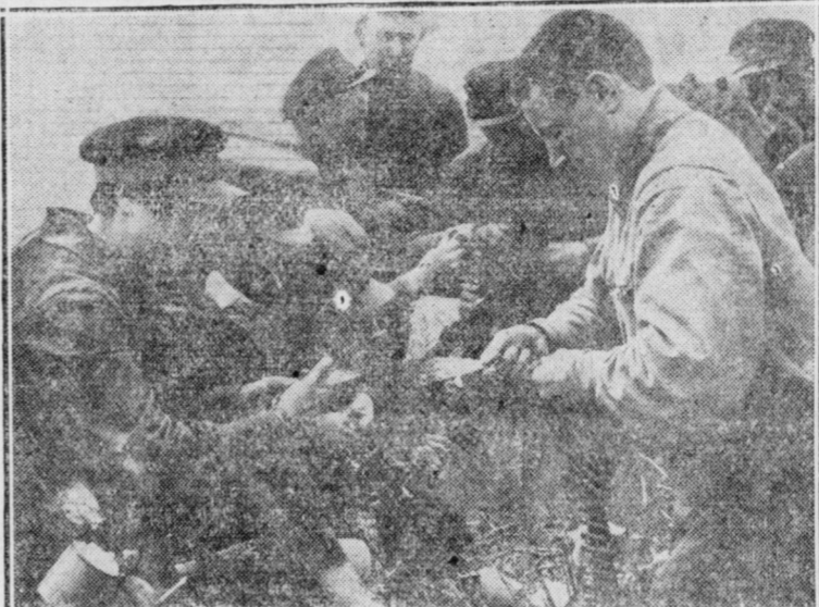
Red Army troops, ready to defend the Soviet Union, are shown above. At the left, Red Army troops at Kiev, training dogs for sanitary corps' relief service.