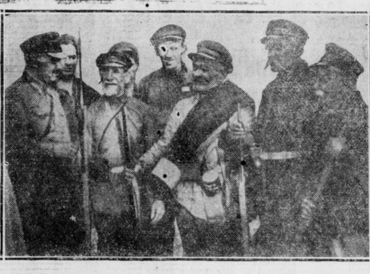
They, and the Red Army troops, know that the workers of the world will not stand by and allow the imperialists, thru their puppets, the Chinese war lords, to attack the U. S. S. R.