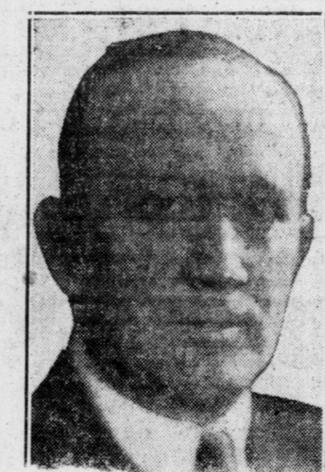
WM. Z. FOSTER Communist candidate for Governor New York State