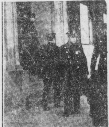
They're there to keep the jobless from getting relief.

Relief bureau officials fear the Unemployed Councils because they are well aware of the Councils' policy of opposing organized red tape and espionage with organized mass de-