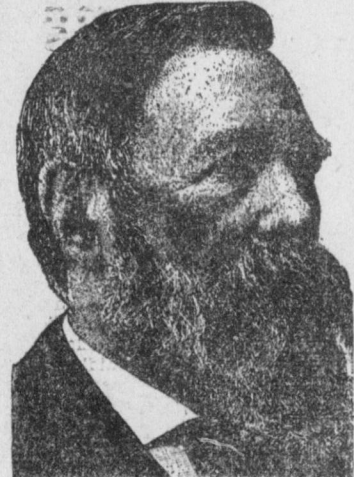
FRIEDRICH ENGELS 1820-1895