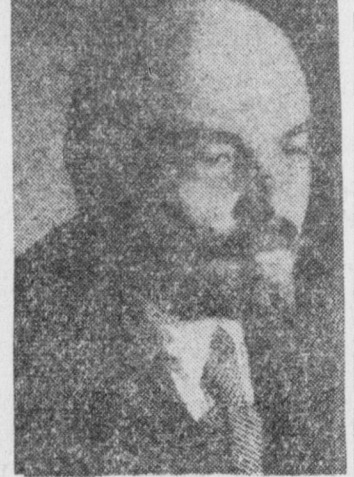
V. I. LENIN 1870-1924