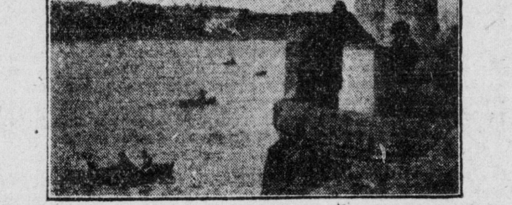
The Moscow Park of Culture. Every day thousands of Soviet workers come here for rest, educational pursuits and recreation. The photo shows a pavilion in the Park overlooking the Moscow River.

Cool apartment houses with efficient ventilating systems were vacant, their unrented floors in sharp contrast to the crowded, sweltering conditions of workers' living quarters in many of which several families are crowded into dark, hot rooms. This condition is especially true in Harlem and the lower East Side, where, as conditions grow worse, workers are packed into even more miserable and unhealthy living quarters.