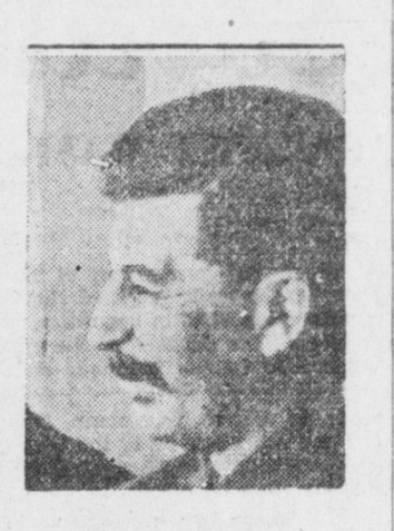
JOSEPH STALIN 1879-