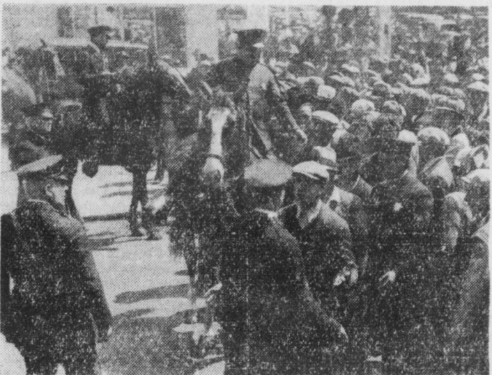
OVER A THOUSAND STRIKING LONGSHOREMEN picket Pier 14 on the San Francisco waterfront where the embarcadero office for scabs is located. Mounted police with drawn clubs are trying to force the strikers across the Embarcadero.