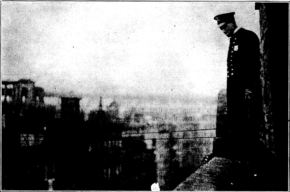
SPYING ON STRIKE SYMPATHIZERS.