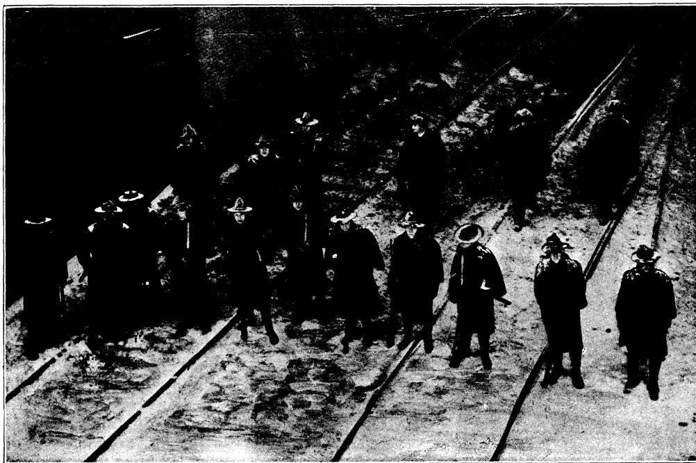
SOLDIERS GUARDING RAILWAY AND ATLANTIC MILLS.