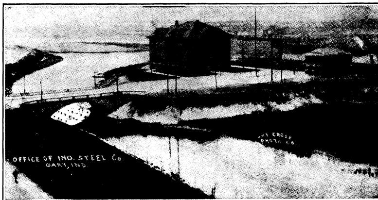
APPROACH TO GARY PLANT—COMPANY'S POLICE STATION GUARDS ENTRANCE.