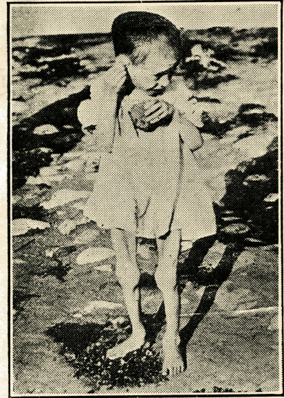
ONE OF THE VICTIMS

The present menu of these children: Wild grass and mud cakes, refuse of all sorts, which means death. THEY NEED YOUR AID NOW.