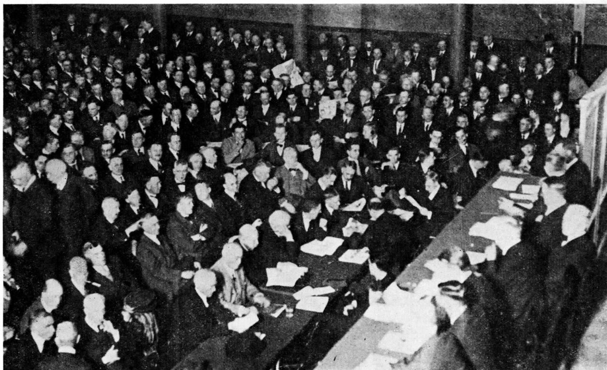
Underwood and Underwood.