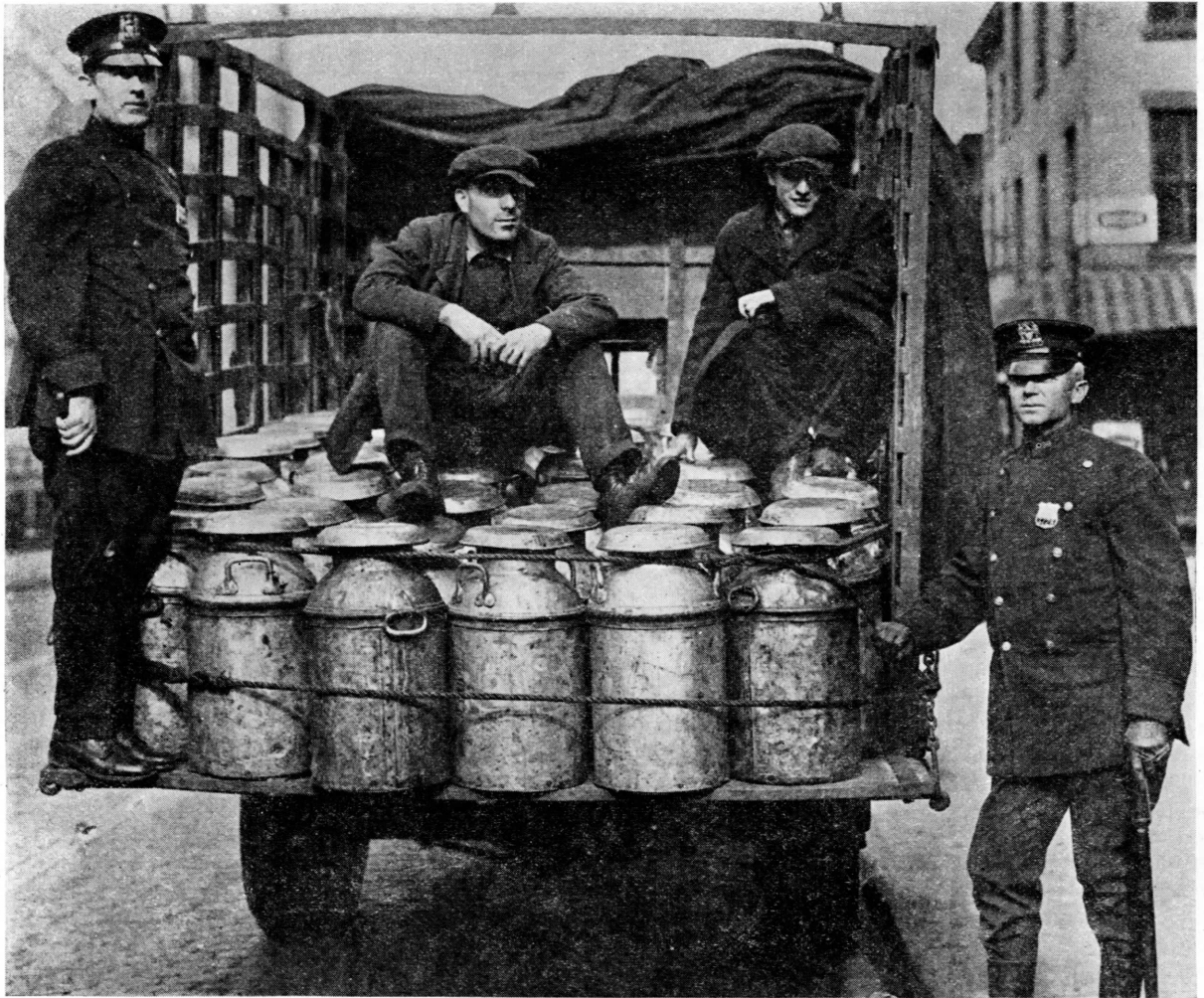
Underwood and Underwood.