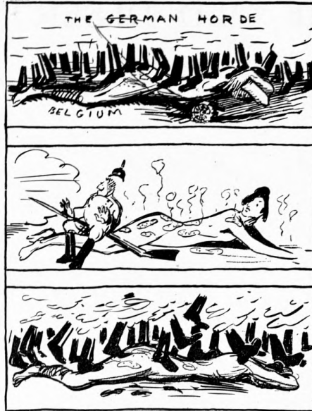
Drawn by Stuart Davis.

In England, things are even worse. There is little real popular enthusiasm visible anywhere. By bullying signs and speeches, calling everybody cowards,