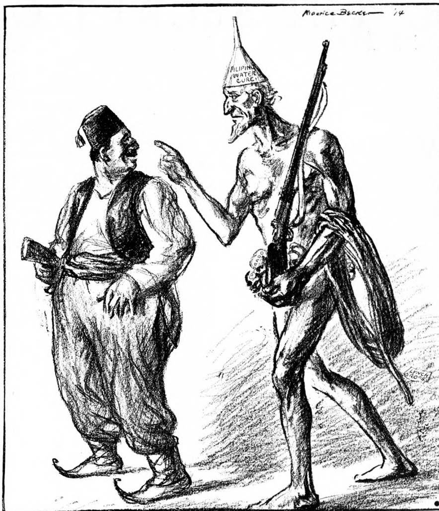
Drawn by Maurice Becker.

The only hope of permanent peace lies in a woman's war against war.