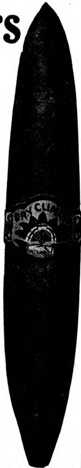
Exact length and shape of Dry Climate—Mohawk size. 2 FOR 25 CTS.

It is milder and has fine aroma and taste.