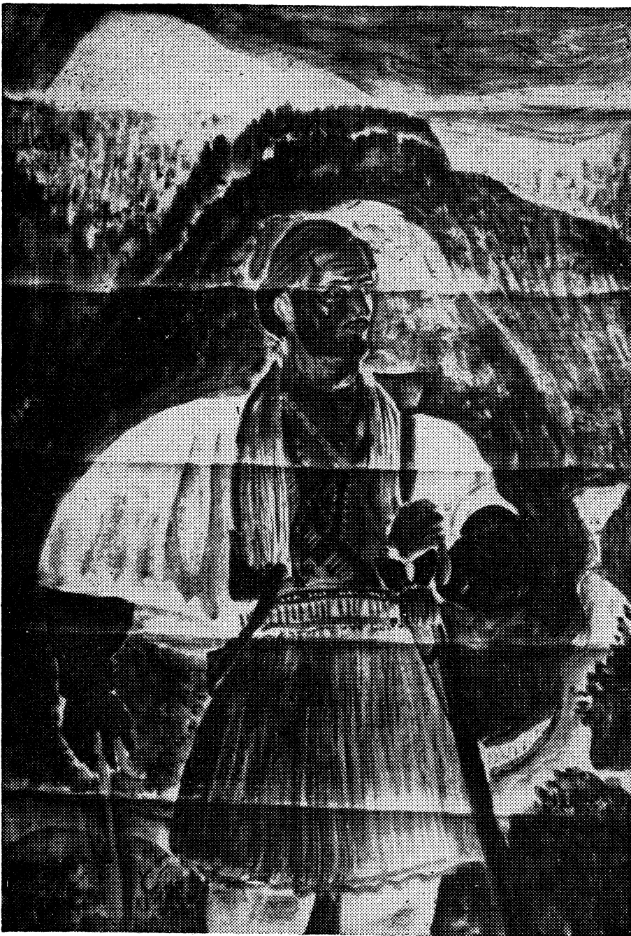
Greek poster of ELAS guerrilla, photograph by Hellenic Dept. of Information, Cairo.