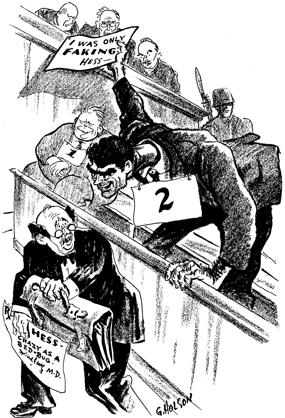
Who's loony now?

The Times does not even present a logical conservative argument. And the reason for this is what we must now explore. The answer will lead us in the direction of the truth.