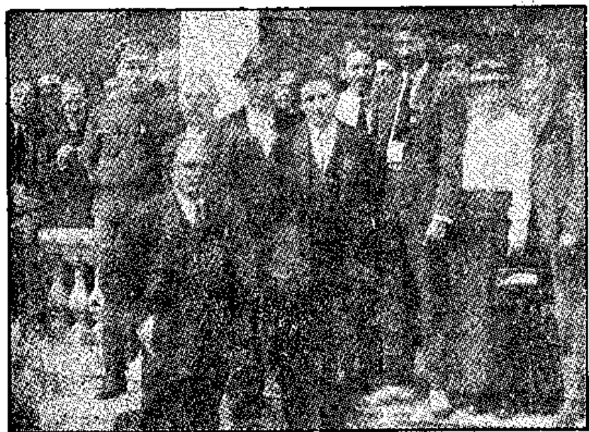
In the above picture are to be seen, from left to right: Radek, Bukharin, Lenin, Gurki, Zinoviev, ROY, Bombacci.