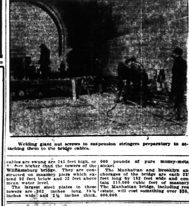
Welding giant nut screws to suspension stringers preparatory to attaching them to the bridge cables.