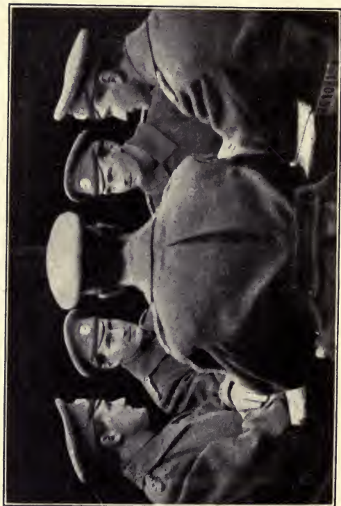
THE AUTHOR. PETROGRAD, 1916 (RUSSIAN RED CROSS UNIFORM)