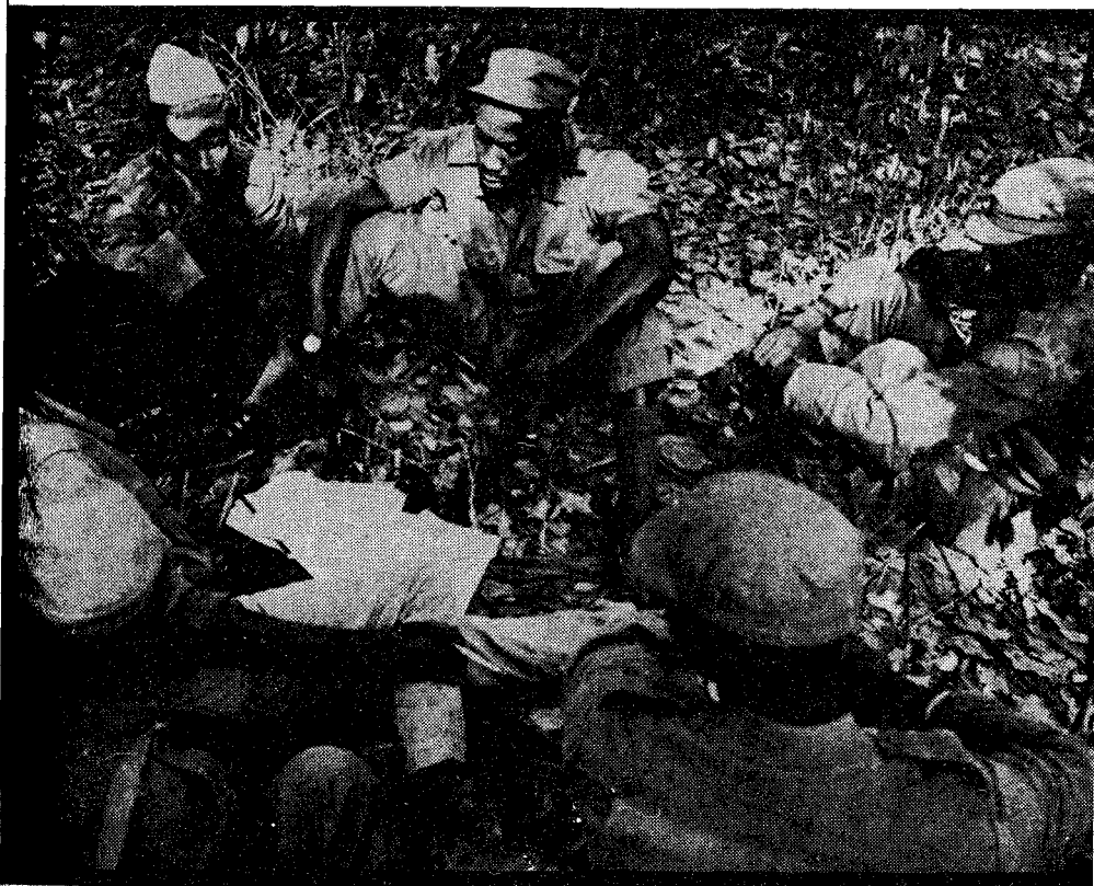
Guerrillas at a ZAPU camp

were forced to develop our position on important issues like the ownership of the means of production, including the ownership and use of land, and the control of the state apparatus.