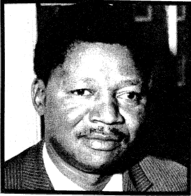
Edward Ndllovu, National Secretary of ZAPU (Zimbabwe People's Union)