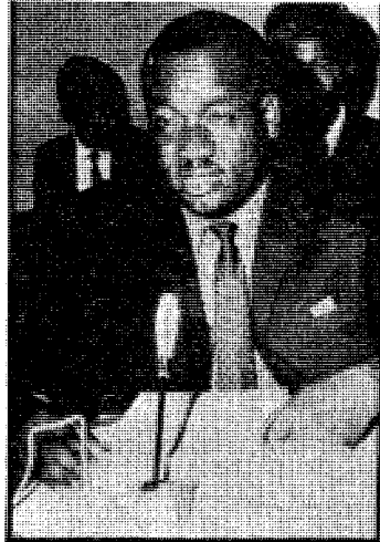
Comrade George Silundika.

George Silundika was born in south-western Zimbabwe near the Botswana border in 1929. His father, a store manager, sent him to mission schools for an education — first to a nearby location and later to South Africa for secondary education. In the early 1950's while attending university at Fort Hare he became involved in the nationalist movement through the Youth League, which at the time played an important part in heightening anti-colonial and anti-racist consciousness among the youth of southern Africa. As an active and outspoken nationalist, Silundika soon became a "security risk" to the racist regime and was accordingly dismissed first from Fort Hare and then from the University of Lesotho. Following these expulsions he was fired from several jobs in Zimbabwe for his political views.