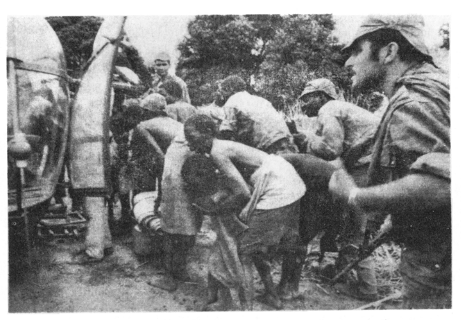
Mozambicans being rounded up for transportation to a concentration camp

At the same time, with the aim of creating contradictions between the militants and the leadership and between the masses and FRELIMO, the enemy infiltrated large numbers of agents provocateurs and subversive elements among us.