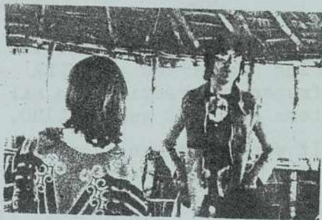
some friends who recently visited one of our bases in the third political militar region

Some English friends, who became attached to our Cause, visited us in order to get an idea of the reality of our armed struggle.