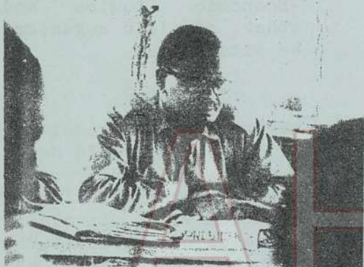
during the work of the plenary meeting

1 | Plenary meeting of the mpla steering committee