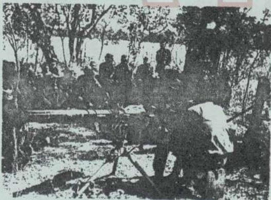
planning one attack with one of our artillery

After taking into account re- cords of the considerable deve- lopment achieved in our control- led zones concerning national reconstruction work, especially in the fields of agricultural production, health services, edu- cation and commerce, it was found necessary to improve the level of responsability within