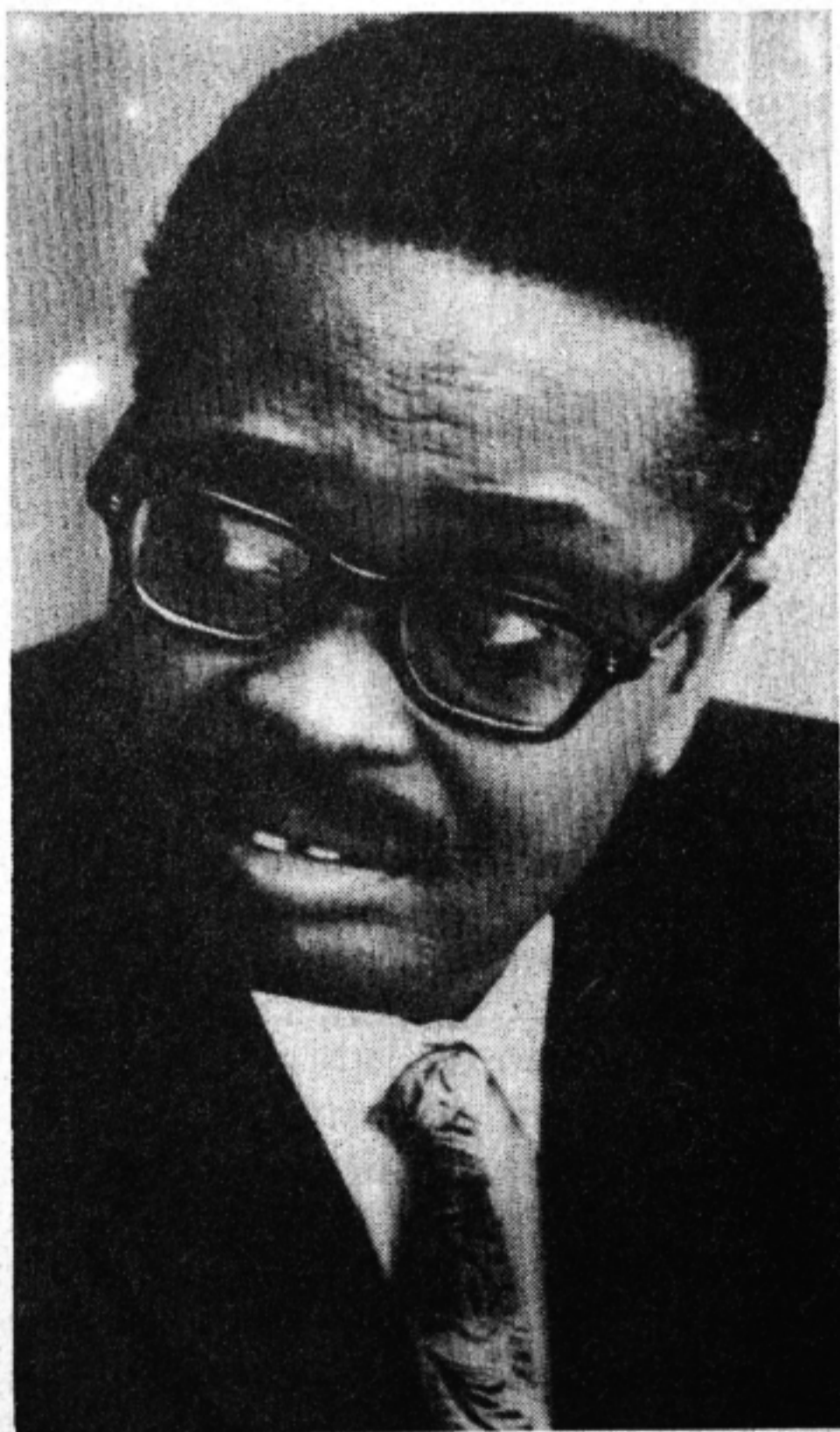
President Agostinho Neto of PR Angola

We are aware of the fact that the great European capitals were built primarily through the blood and sweat and patient work of millions of exploited people in our continent, as well as that of the natives of America and Asia. Capitalists at a certain juncture could not continue to exploit the resources of certain countries, so they started to export their capital, so that, in one way or another, they were able to continue to dominate and exploit people. This is the essence of the contradiction which our world is facing today. The principal problem does not lie, nor has it ever lain, in the colour of the skin, nor in the social status of the person. The principal problem lies in the opposition between exploited and exploiters, and dominated and dominators. The contradiction lies between those who own the