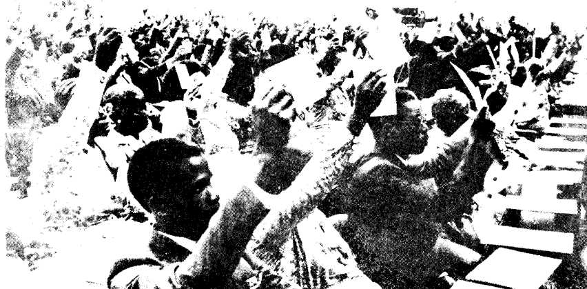
Delegates during a vote on a resolution presented at the Fourth FRELIMO Party Congress.

Peasants also told of how they successfully fought the MNR. The delegate from a communal village in Gaza recalled how the villagers who had armed to defend themselves, pursued and captured a MNR band which attacked the village. The request from his village was for better weapons.