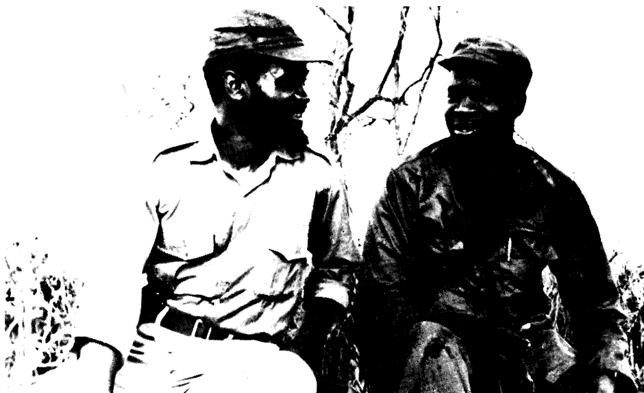
Samora Machel, Mozambique's president and leader of the party with Eduardo Mondlane, FRELIMO's first president in a photo taken during the armed struggle.

The raid at Chai marked the beginning of the armed struggle against the colonial regime. Employing classical guerrilla tactics—ambushing patrols, sabotaging communication and railroad lines, and making hit-and-run attacks against colonial outposts—and then rapidly fading into inaccessible backwater areas, FRELIMO militants were able to evade pursuit and (Continued on page 10)