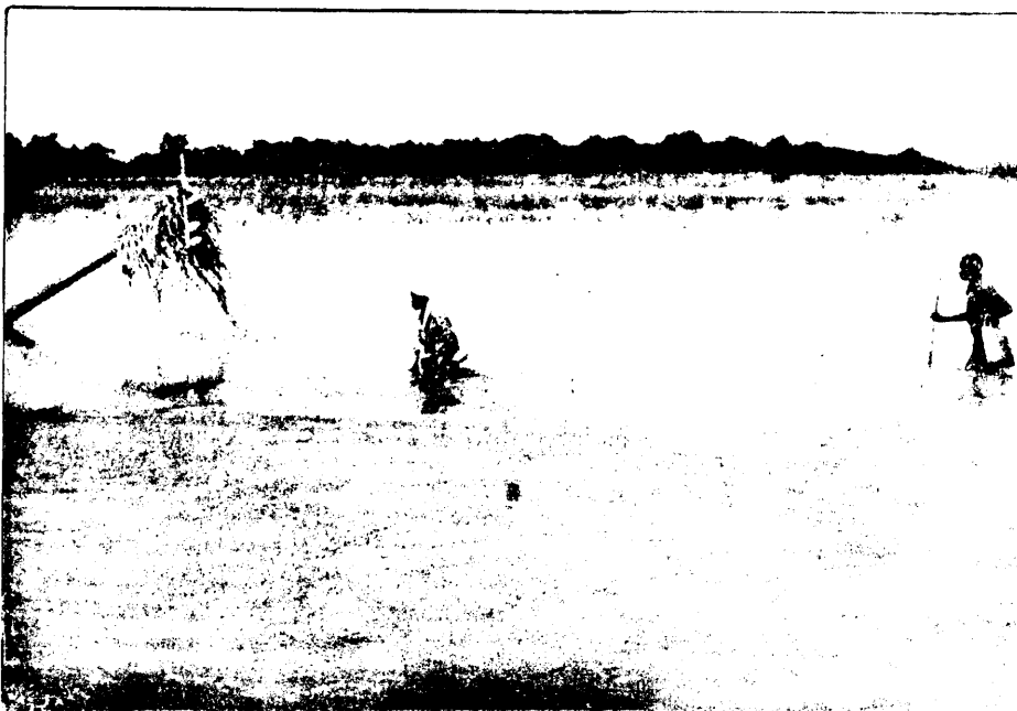
Villagers walking in street covered by flood waters in Maputo Province.