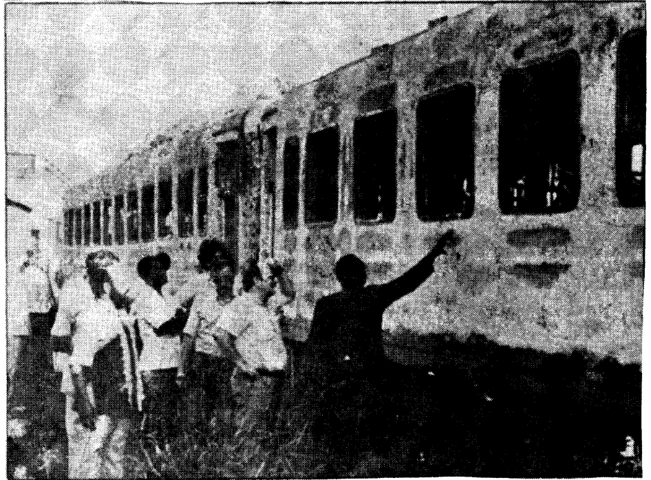
Train recently attacked by the MNR.

According to eyewitness reports, the bandits waved down the vehicle. Tivane stopped, possibly thinking that it was a FPLM road check. As he