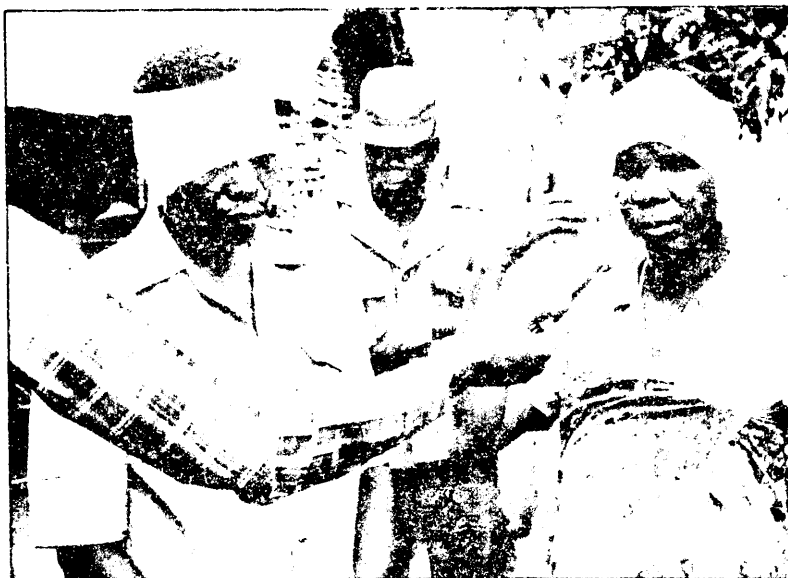
Villagers whose ears were cut off by armed bandits in Gorongosa in 1979.