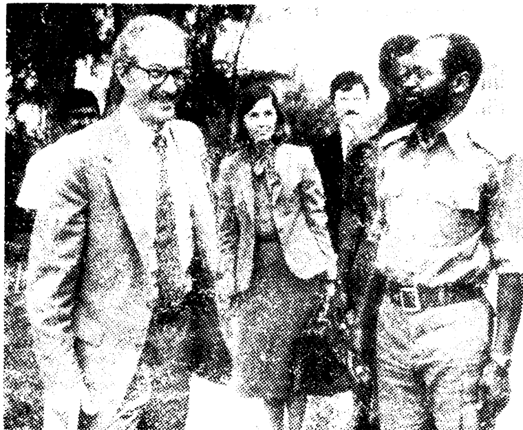
President Samora Machel with Assistant Secretary for African Affairs Chester Crocker during a visit this year to Mozambique