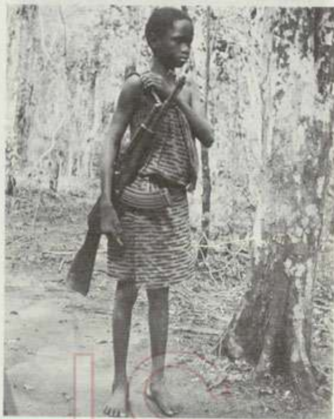
escudos for the navy, PSP, PIDE, Voluntary Corps and public security.

All these measures hardly conform with official statements about guerrillas being "progressively eliminated", but then neither does the latest huge offensive mounted by the Portuguese in Mozambique.