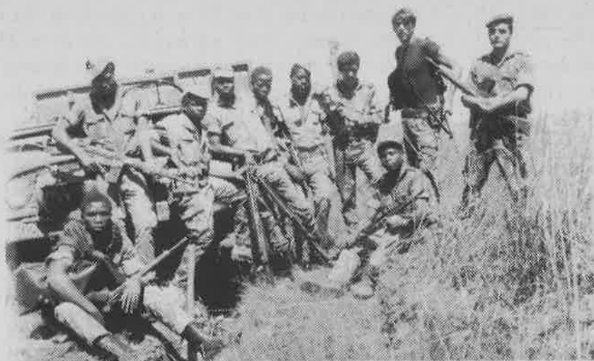
Portuguese colonial soldiers put out of Action in Angola - 1971.

FreeLand of Angola, Central Base of Military Region 2, Angola, May 10th 1971 (signed) by Commander-in-Chief of the Armed Forces for Liberation of Angola (FALA)