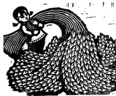
Woodcut by Tung Chi-chung

Throughout the country the gathering of the autumn harvests is coming to an end. In the countryside, you can see broad smiles on people's faces. From more than 800 million mu of farmland planted to autumn crops the people's communes are bringing in a harvest richer than the record one of the big leap year of 1958. In the North China provinces an excellent rice crop has been reaped from 30 million mu of land, with many areas obtaining increases in yield ranging from 30 to 40 per cent. Both in per mu yield and total output, the peasants in North China have bettered last year's amazing record—and this from 540 million mu of maize, millet, sorghum and other coarse grains. At the moment the commune members in North China are busily