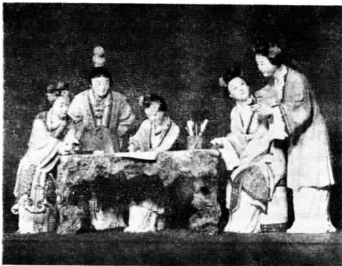
Figures depicting a scene in the classical novel Dream of the Red Chamber by Clay Modeller Chang

be worth a public exhibition in the near future. A colour, wide-screen stereoscopic film on the famous Kweilin landscapes in the Kwangsi Autonomous Region for the Chuang People, in South China, also showed good results. All the equipment used in the panoramic film production was produced domestically. China is now the third country after the Soviet Union and the United States with the technical know-how to produce this new equipment.