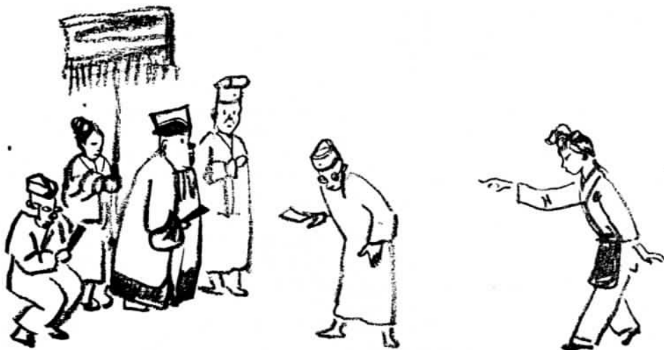
Liu San Chieh Confounds the Scholars

I was born with an unusual trait: Songs I love, but money I despise. Only he who can sing can win me.