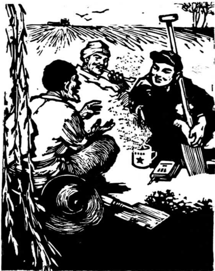
A Cadre Gets the Peasants' Views