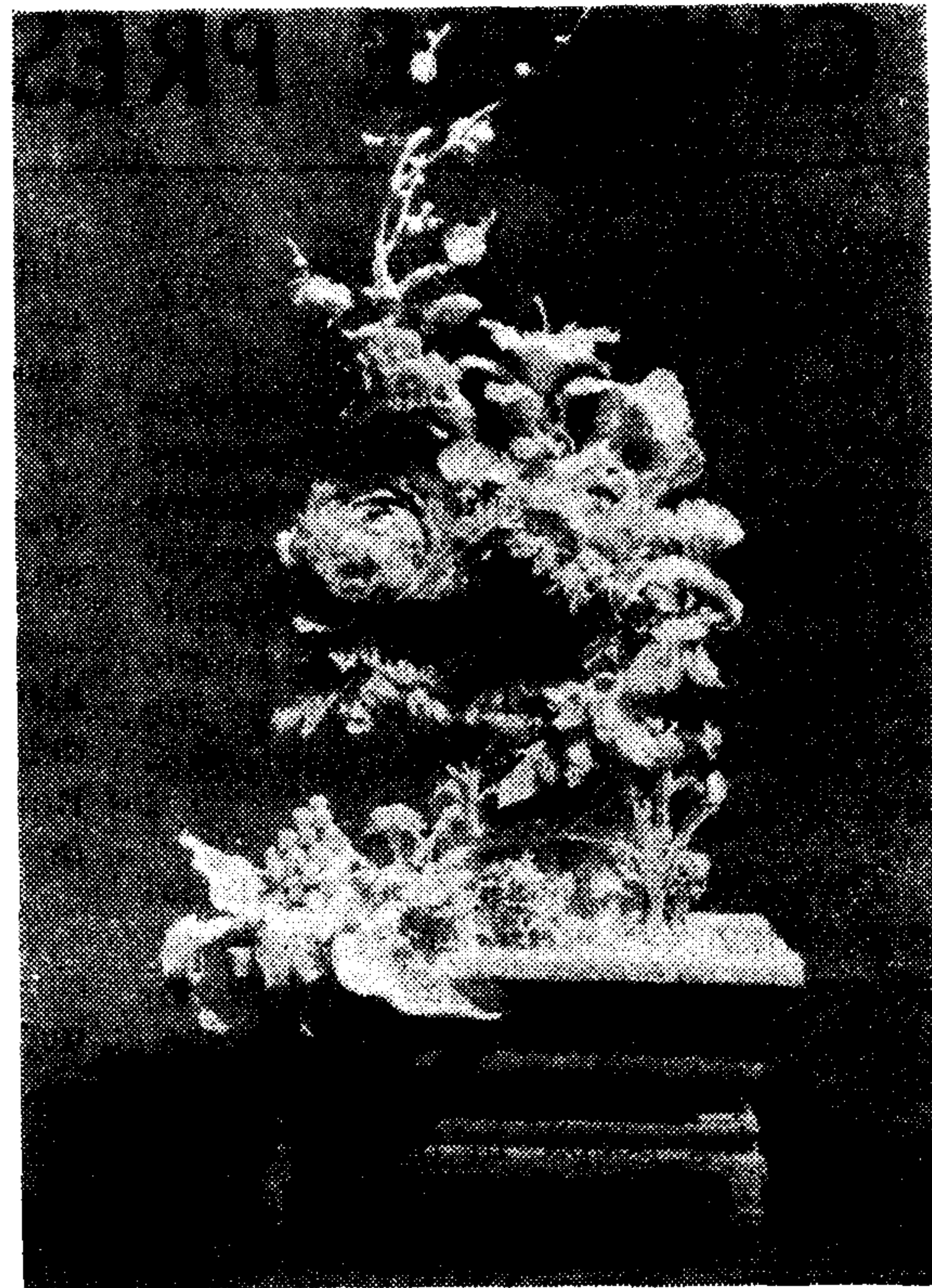
Salute to July 1

Another group of artists of the Peking Ivory Workshop has completed another new work dedicated to the Party and entitled, "A Million Troops Cross the Yangtse." This shows the scene of the historic river crossing in the final stages of the Liberation War. It is carved in relief in ivory and set on a hardwood background also carv-