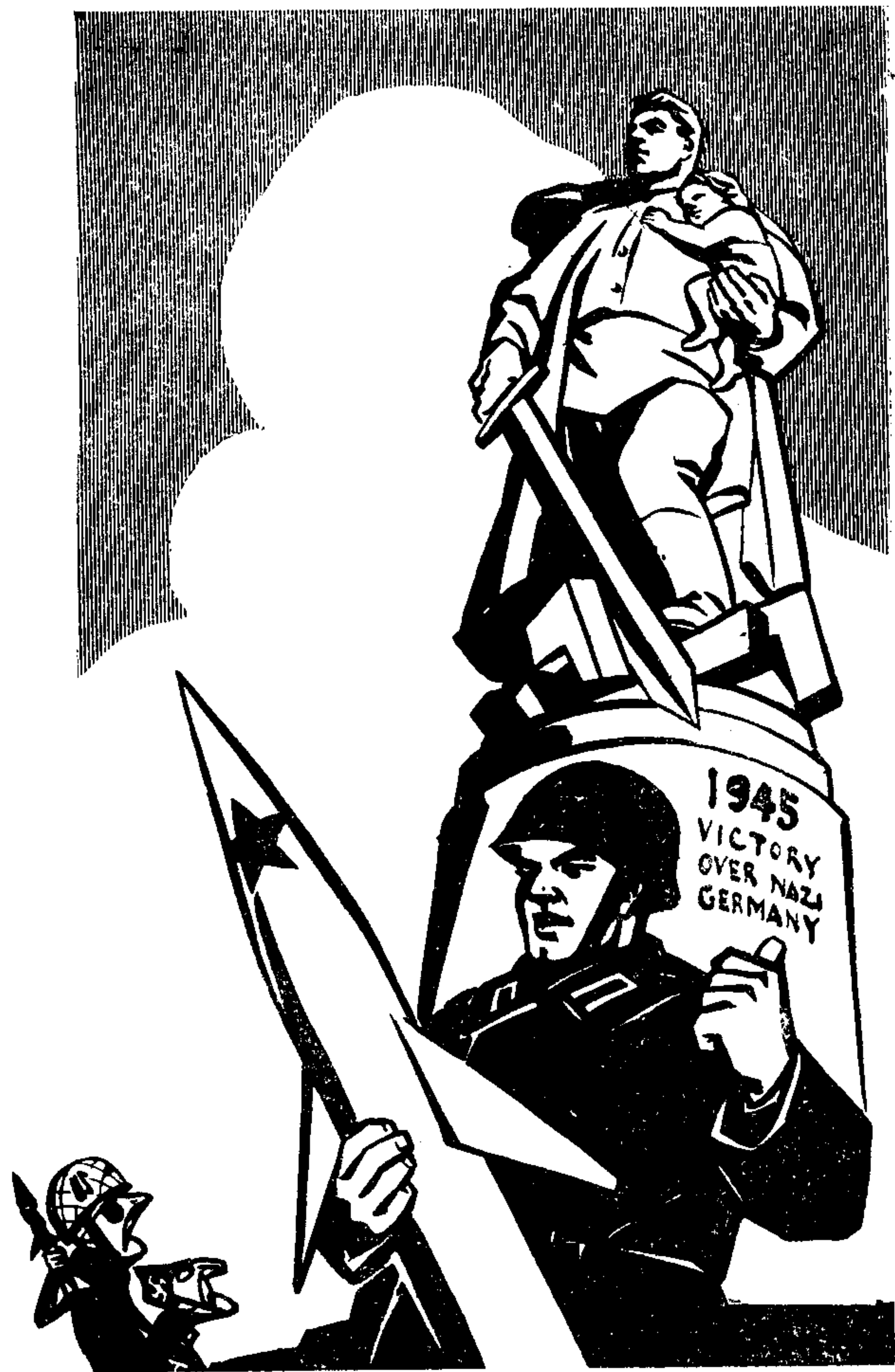
Remember Hitler's End!