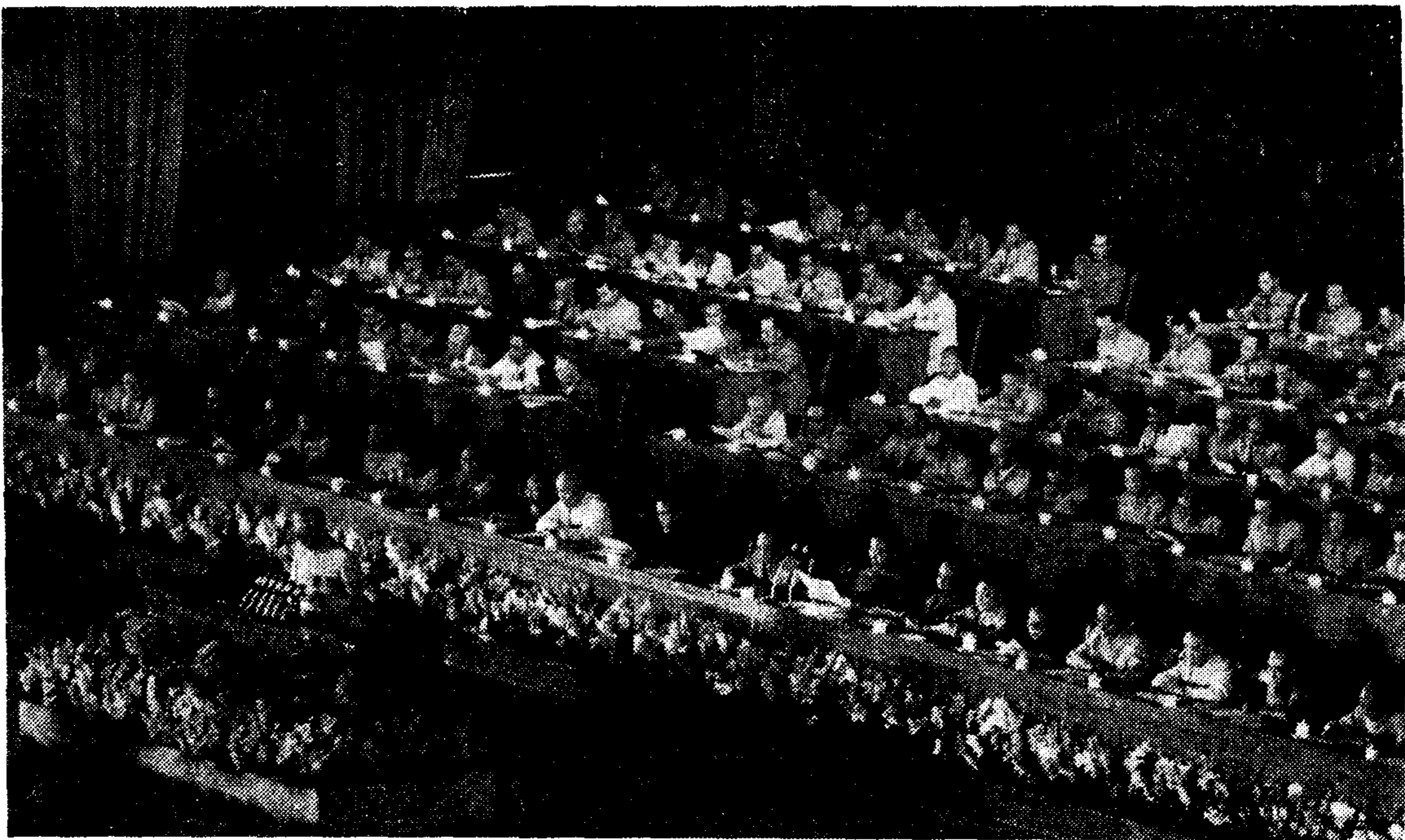
Comrade Liu Shao-chi addressing the anniversary meeting

correct Marxist - Leninist political party. ( Prolonged, enthusiastic applause. ) It has been unswerving in its loyalty to the interests of the Chinese people and of the Chinese nation. It has never bent nor flinched before domestic or foreign enemies. It has led the Chinese people to great victories and will lead them to still greater victories. ( Enthusiastic applause. )