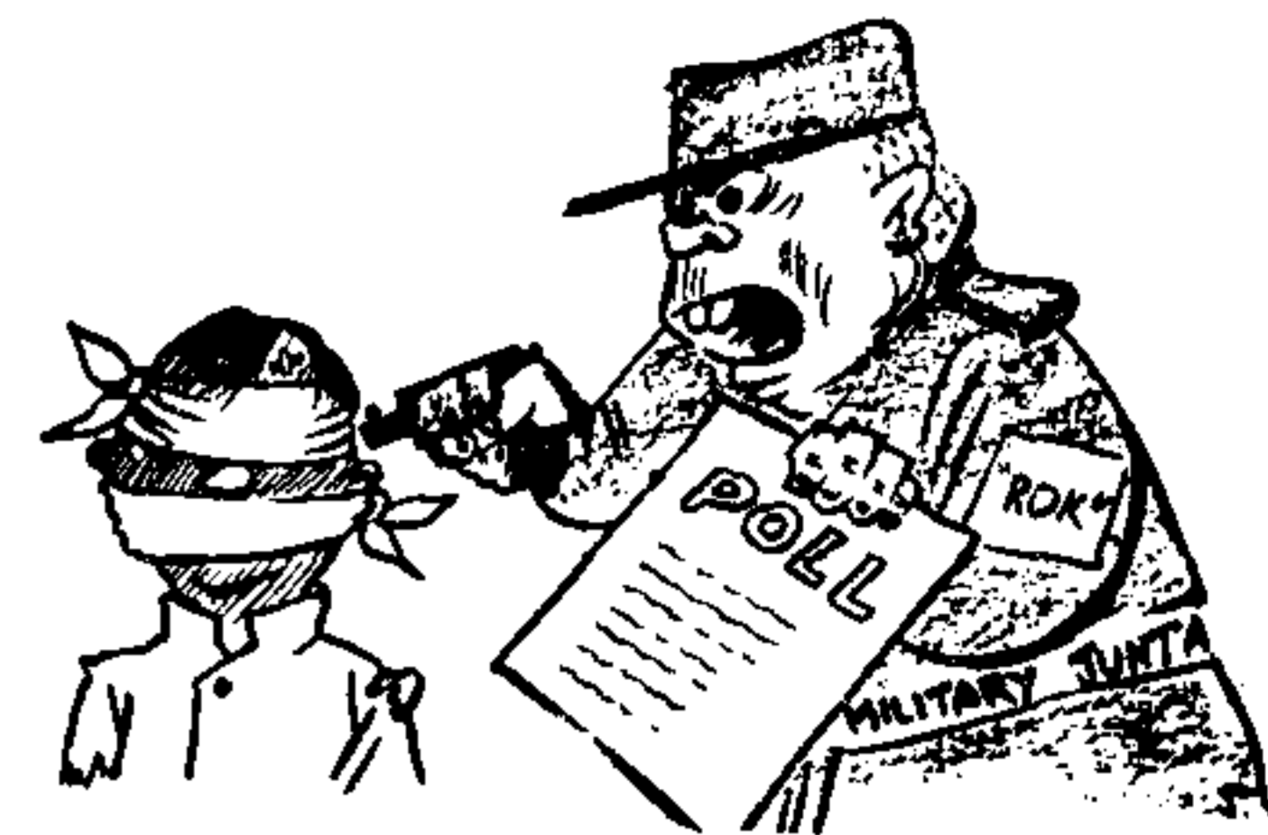
"What do you think of me? Speak up!"

In south Korea where the military junta operating under martial law decree has banned all political parties, trade unions and other social organizations, closed 70 out of 100 newspapers, made mass arrests and passed sentences of death or life imprisonment on political prisoners, the "Information Ministry" announced the holding of a public opinion poll on what the public thinks about the "revolutionary government"; 1,500 persons in Seoul were "polled" over a period of three days.