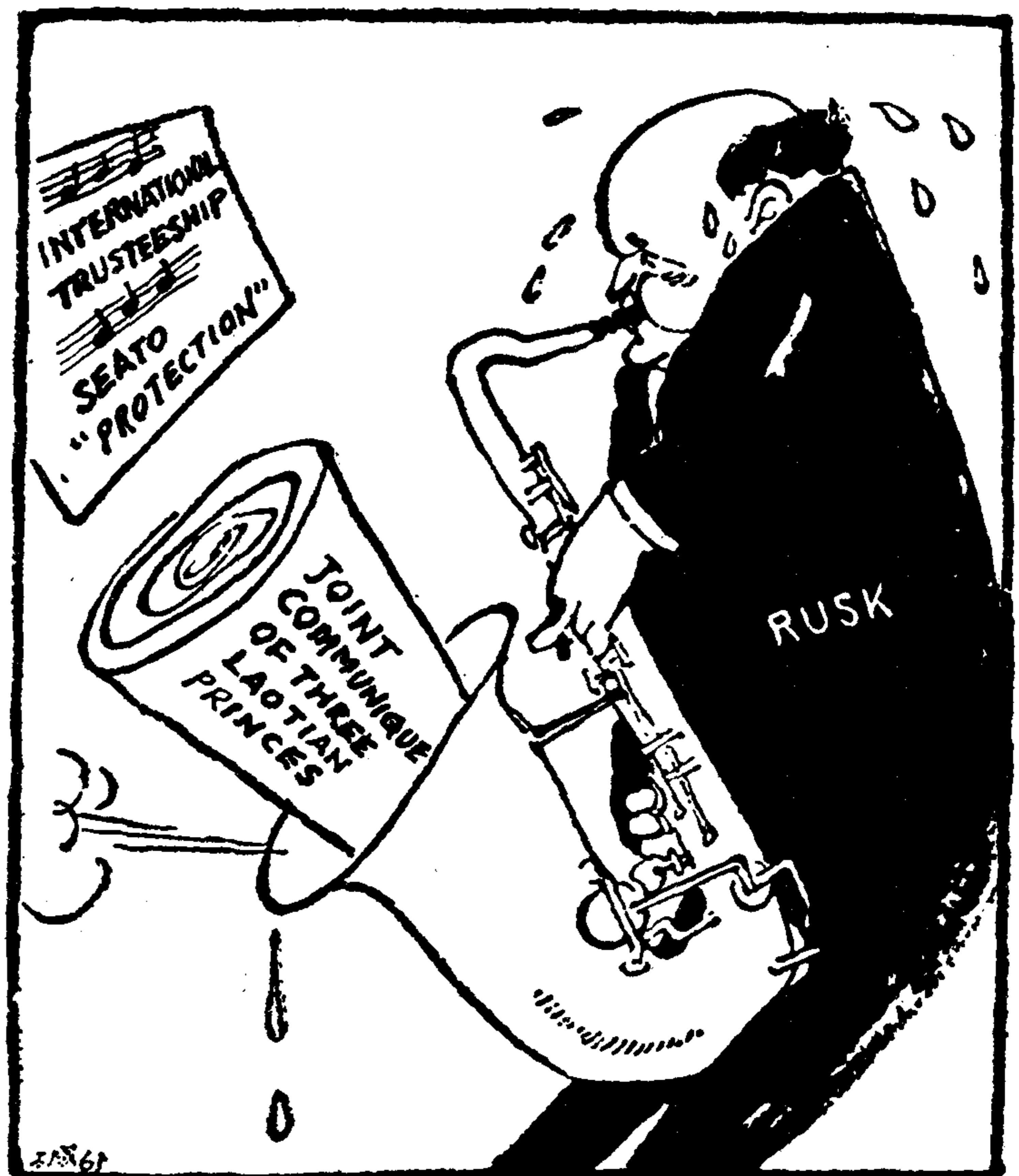
It's Getting Harder and Harder to Play This Tune

Provided that all of us have the sincerity to settle the Laotian question peacefully, it should not be difficult to reach unanimity on the terms of reference for the International Commission. This is the most sharply disputed issue here. I wish to point out that from the very beginning the issue is not one of assigning the International Commission broader or narrower functions and powers, but one of deciding what its reasonable functions and powers should be. We hold that necessary and reasonable functions and powers should be assigned the International Commission on the basis of respect for the sovereignty and independence of Laos. Just as we are against turning the International Commission into a state within a state or a super-government in Laos, we are also against restoring its terms of reference as stipulated in 1954 without any change. Why? Because that would be unreasonable. I have explained our reasons both in my last statement and in my statement today. We have had heated debates on this question. However, I would request you all not to ignore the fact that on this question