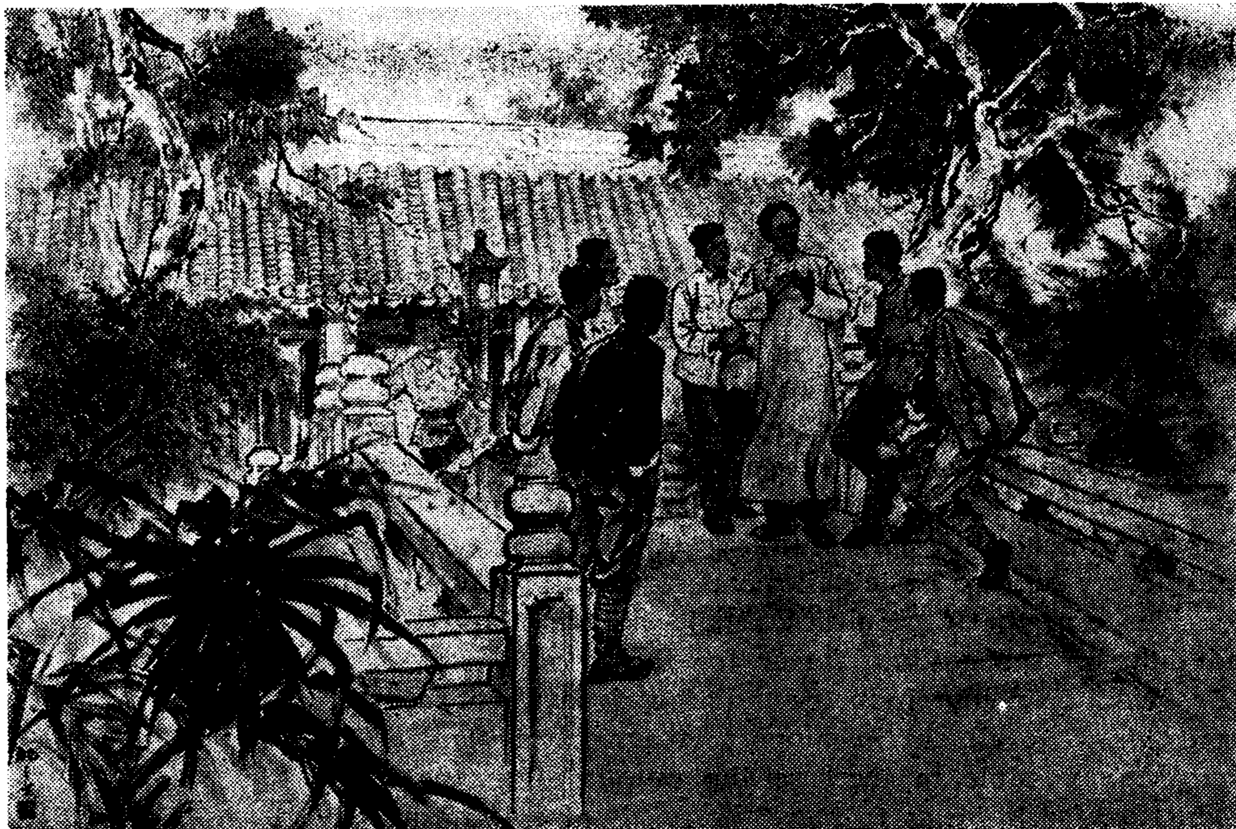
Chairman Mao at the National Institute of the Peasant Movement in Canton

Our general line is developed and perfected through practice, and the various specific policies and specific measures essential for its realization have also to be developed and perfected gradually through practice. During the big leap forward of the last three years we have had tremendous achievements, and the general line and the various specific policies and measures have all been developed. At the same time, there have also been quite a few shortcomings in our work which, together with the serious natural calamities of the two successive years, have given rise to some temporary difficulties. In a large country like ours with a population of 650 million, a country that is economically and culturally backward, it would be inconceivable for such a new undertaking as socialist construction to proceed without shortcomings, without running into any difficulty. Historical experience has proved that no difficulty, no shortcoming, can frighten us; on the contrary, we have always steeled ourselves and become stronger and more correct in the course of extending our achievements and overcoming all kinds of