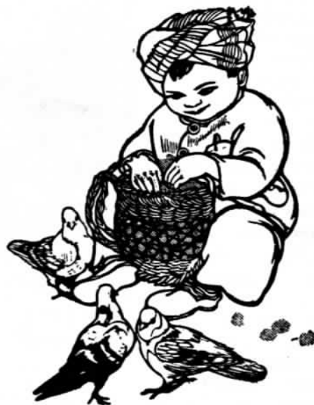
Woodcut by Huang Yung-yu

Soochow the Garden City. Soochow has never been lovelier nor more prosperous. The Kuomintang regime condemned it to decay but energetic measures taken right after liberation quickly revived it. Now this famous city with its lovely villas amidst pleasure gardens, and hills topped by temple or pagoda has grown new suburbs with big factories and modern schools. Its famed handicrafts flourish as never before. Its storied temples, mosques and pagodas have been repaired and restored. The lovely Ming Dynasty Liu Garden which the Kuomintang had turned into a military stable, the 1,000-year-old Yunyenzu Pagoda on Tiger Hill have been re-