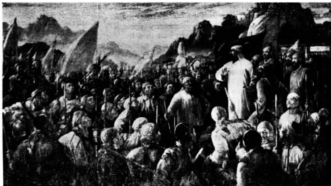
The Outbreak of the Taiping Revolution in Chintien Village, Kwangsi, in 1851

The growing national crisis led to the Reform Movement of 1898. On exhibit is a long memorial presented to Emperor Kuang Hsu by Kang Yu-wei and other civil-service examination graduates proposing immediate reforms. This was a reformist movement of the bourgeoisie which exerted great influence among the intellectuals at that time and politically and ideologically dealt a blow