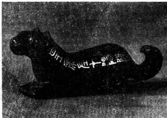
Tiger Tally of the Chin Dynasty

The whole period of feudal society is marked by struggles between the peasants, ruthlessly oppressed and exploited, and the land-owning, feudal oppressors. China's feudal history records hundreds of peasant uprisings, big or small. On display here are many objects reflecting the many-faceted activities of these uprisings: official seals, coins of many descriptions, weapons, pictures of ancient battlefields, and stone rubbings recording the disciplinary rules of insurgent