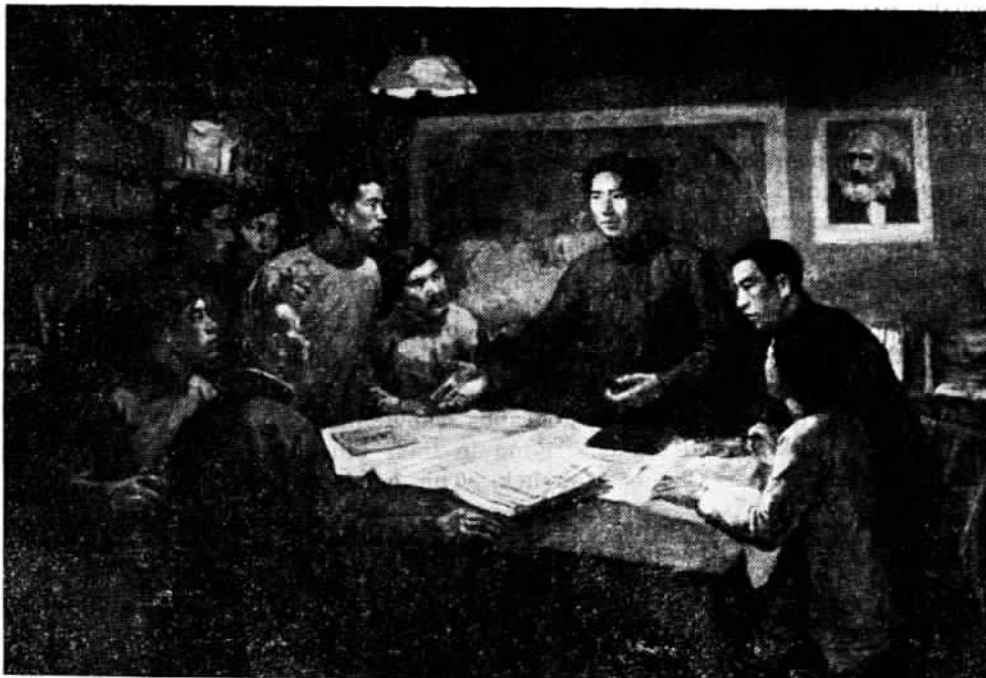
Comrade Mao Tse-tung and other members of the Hunan Marxist Group

There is on display a model of the house in which the Congress was held—No. 78, Wang Chih Road, Shanghai, the birthplace of the Party. Beside the model of the house is a model of a pleasure-boat. It was on such a boat on the Nanhu Lake in Kashing, Chekiang Province, that the Congress held its last session because the meeting place in Shanghai was discovered by secret agents. Following the founding of the Party, the Chinese Socialist Youth League (S.Y.) was also established. There is a photograph, taken in Paris, of Chou En-lai, Teng Hsiao-ping, Li Fu-chun, Nieh Jung-chen and other comrades—members of the General Branch of the S.Y. in France. Comrade Mao Tse-tung said: "In China, the Communist Party was born, an epoch-making event."