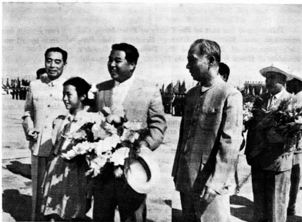
Premier Kim Il Sung and other Korean guests with Chairman Liu Shao-chi and Premier Chou En-lai at the airport

Speaking of the significance of the new treaty, Premier Kim Il Sung declared that it "has sealed in written form the relations of fraternal friendship and alliance between our two peoples formed and developed in their long-term struggles for common aims, and has