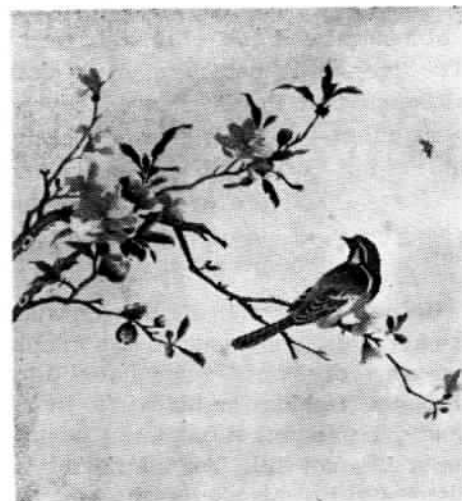
Soochow embroidery "Bird and Flowering Bough"

Her life well epitomizes those of her generation of craftsmen. At the age of 35, even though she had been making an independent living for 22 years working at embroidery, she was married in the feudal style to a man chosen for her by her parents. Soon she was left a widow and embroidery became her sole means of support for her family. But in those days this was a slowly dying art. The day came when she was forced to give it up and take work in Shanghai as a maid-servant. It was here that the People's Government, learning that she was a student of the great Ching Dynasty embroiderer Yu Shen-shou and an expert embroideress in her own right, sought her out and asked her to return to Soochow. It was a startling turn of fate. Once again she found herself able to work at her craft and under ideal conditions at that. As she put it, her heart was filled with so much undreamt-of happiness that she found