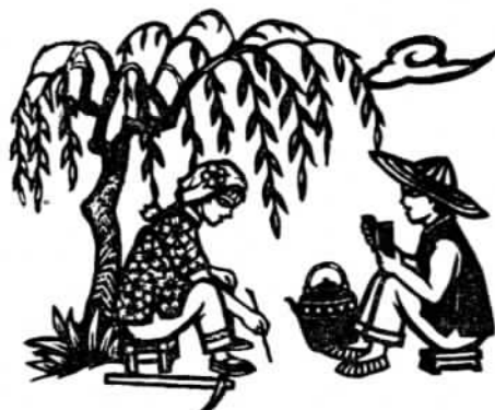
Learning to Write

Builders Study. Ask any building worker in Shensi Province and