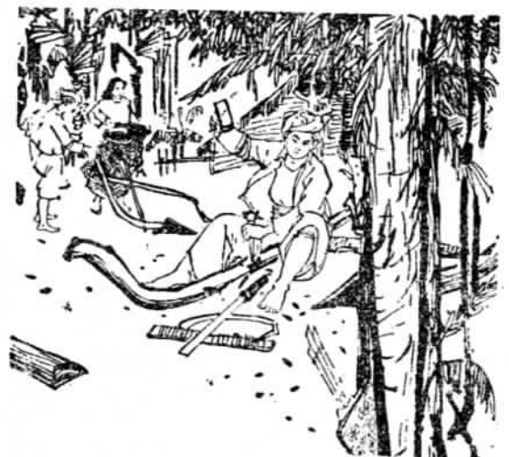
Chingpos Making Ploughs

With his precious packet back in his hands the bank clerk heaved a sigh of relief.