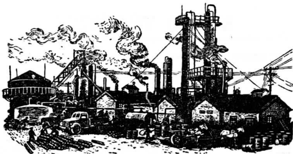
A Rural Fertilizer Plant