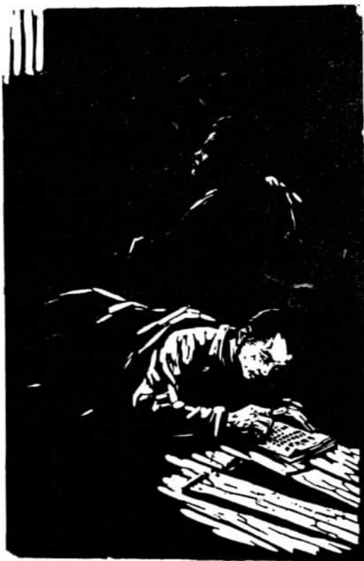
Illustration to "Red Crag" by Cheng Wei

integrated whole, ably unfolding the background, creating the atmosphere of the time, and bringing a score and more of living characters into the scene.