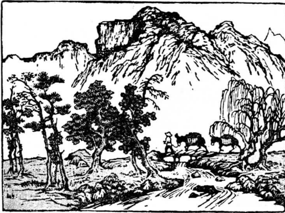
Autumn in the Mountains