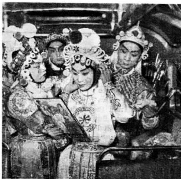
Chinese actors and actresses in Helsinki—working to a tight schedule, they often had to make-up en route on the bus

We also gave several separate special programmes for our friends from other Asian countries, from Africa and from Latin America. These always included items from the countries of our guests: songs, dances or instrumental pieces. And invariably these received standing ovations. When our orchestra played the Guinean melody The Elephant , or Ghanaian tune Happy Life , and our