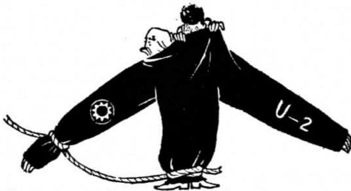
Cartoon by Ying Tao

The Chinese Government statement declares: "So long as U.S. imperialism persists in its policies of aggression and war, so long as the United States still occupies China's territory of Taiwan, China's security cannot be ensured, nor can the tension in the Far East and the world be eliminated. For the sake of China's security and Far Eastern and world peace, the armed forces of the United States must be withdrawn from Taiwan; they must be withdrawn from Japan, southern Korea, southern Viet Nam, Laos, Thailand and the Philippines; they must be withdrawn from all U.S. military bases on foreign soil." This gives expression to the firm, unshakable will of the 650 million people of China. The Chinese people will work in concert with the people of all other countries who cherish peace, to smash the U.S. imperialist plans for aggression and war and safeguard national independence and world peace. When the people throughout the world are united even more closely, the policies of aggression and war of U.S. imperialism will inevitably be defeated; and they certainly can be defeated.