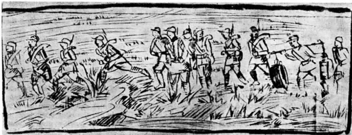
Marching Across the Grasslands