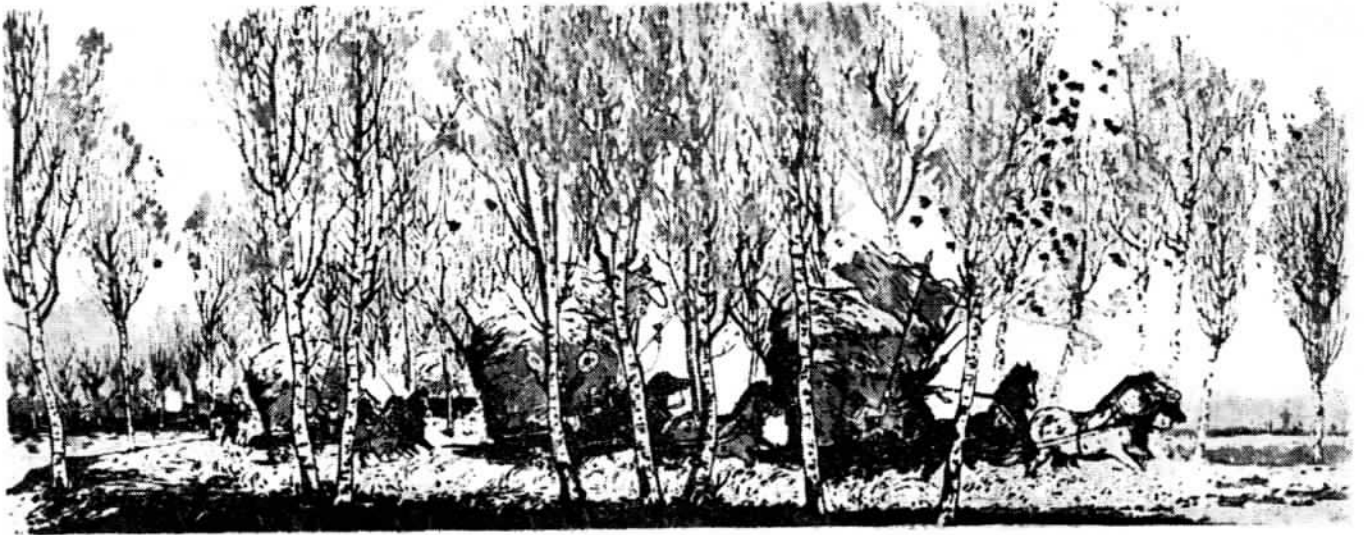
The Trees Have Grown Up