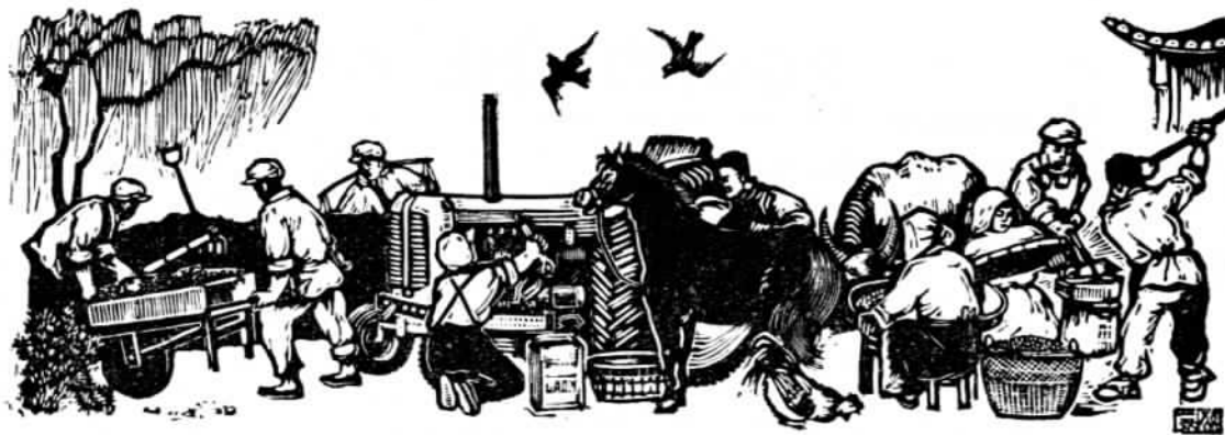
Woodcut by Tung Pao-fa

The Party's fundamental line of policy regarding agriculture is: first, to achieve the collectivization of agriculture; and then, gradually carry out the technical transformation of agriculture and modernize it on the basis of collective farming. In the course of the new democratic revolution and the socialist revolution to date, the Chinese people, led by the Party, has been dealing mainly with production relations, paving the way for the development of the productive forces. They have scored great successes in this respect. They have not only succeeded in collectivizing agriculture in a country with 500 million peasants but discovered the form of social, political and economic organization which suits present conditions in China's countryside—the people's commune. This provides an extremely favourable condition for undertaking technical transformation. From now on, while continuing to consolidate the collective economy, the nation must at the same time develop the productive forces in the countryside, carry forward technical transformation, supply agriculture with various kinds of farm machinery, chemical fertilizers, insecticides, means of transportation, fuel, power, building materials, etc., so as to build its agriculture gradually into a great modern socialist agriculture.