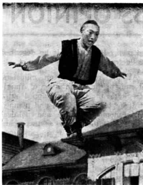
The magician in difficulties during the circus chase

It was a conjuror's toy pistol that got the magician into trouble with the Kuomintang. He forgets that such things no longer happen in New China, so when at a circus searching for his old friend, he sees the young bus conductor looking for him to return a toy gun he left on the bus, he is panic-stricken. He disguises himself in circus togs and there is some good cinema slapstick as he is chased