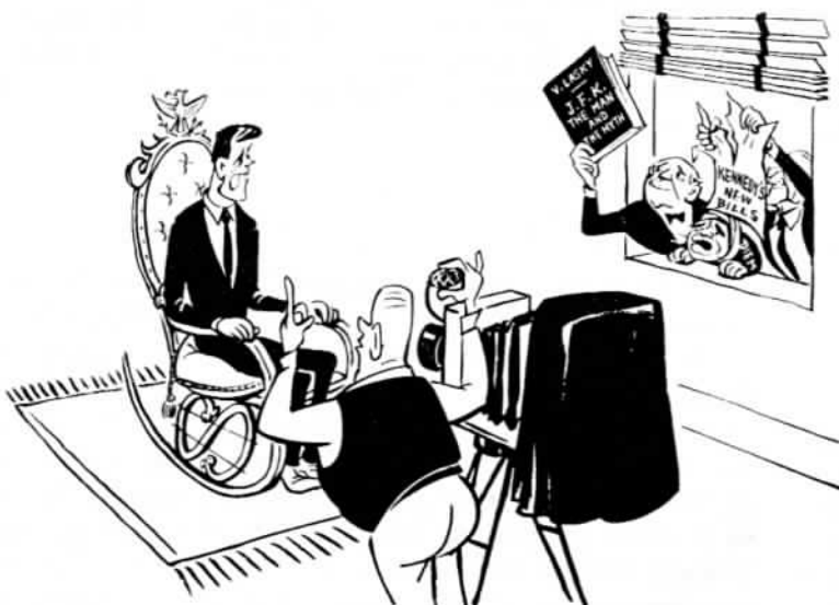
"Mr. President, smile, please!"

"Daddy has many foreign friends who come to see him in his office. But he isn't pleased with one who is also a president like Daddy. He lives in a faraway land called Sai-gon. I heard that Daddy didn't like him because he had a brother with a funny name Nhu, who was an important man in the government. I don't see what's wrong with that. Aren't Uncle Bobby and Uncle Teddy also very important men in our country? Daddy likes them! And when I began to tell Daddy what I thought, he dismissed me with a 'Run along and play, it's not for little boys to ask questions. You wouldn't understand.' I was very hurt and I cried."