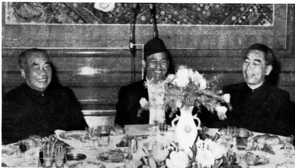
Chairman Chu Teh and Premier Chou En-lai at the banquet given by Chairman Vishwa Bandhu Thapa (centre)

That evening, Chairman Chu Teh gave a banquet in the Great Hall of