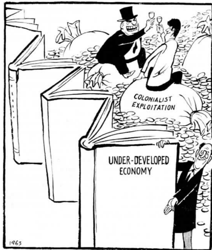
Behind the Screen

If by this is meant economic independence it is obviously a fraud. As a matter of fact, it is exactly through the channels of "economic aid" that the imperialist countries have penetrated vital branches of the underdeveloped countries' economies, controlling their economic life-lines and making them an appendage of imperialist capital. El Salvador provides an example of this.