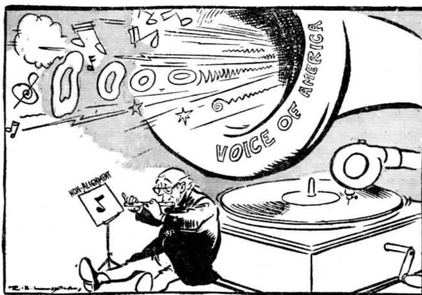
A NEUTRAL NOTE

Militancy in Labour. Analysing the present mood of the Indian working class, the Free Press journal wrote: "There is a new militancy in labour, unknown since the beginning of the emergency. Strikes are considered no more anti-