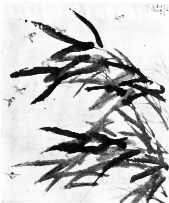
Against the Wind

The most comprehensive collection of Hsu Pei-hung's works, the present showing contains the painter's best and most representative works in traditional Chinese style, oils and sketches, and calligraphy covering the period from his youth to his death. Some paintings have never been shown before. From it viewers can trace the artist's growing maturity and artistic attainment.