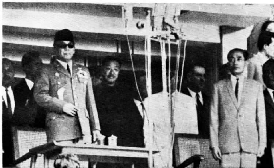
President Sukarno on the reviewing stand; at his left is China's Vice-Premier Marshal Ho Lung

A NEW era in world sports was ushered in on November 10 in the Indonesian capital of Djakarta with the colourful opening of the First Games of the New Emerging Forces (GANEFO). The 100,000-capacity crowd in the flag-bedecked Bung Karno sports complex came to a hushed silence as President Sukarno officially opened the games. The inaugural ceremonies continued as the athletes' pledge was read, the athlete-relayed torch set aflame the GANEFO fire, and the white-background GANEFO flag was raised to the strains of a military band and a 21-gun salute.