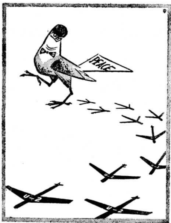
Kennedy's Footprints Cartoon by Cheng Wen-chung

Repeated U.S. provocations and aggression against China are a constant reminder that the class struggle is raging in the international arena and that no reactionary class will make its exit from the stage of history of its own free will. The Chinese people are heightening their vigilance, ready to deal fresh blows to U.S. imperialism, which continues to step up its military provocations and war threats against China.