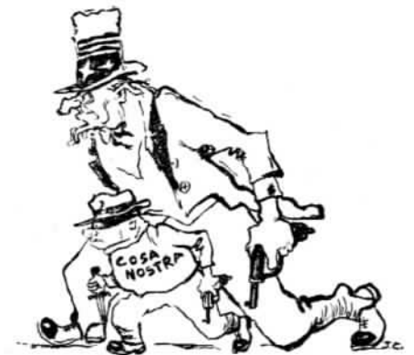
Chip Off the Old Block Cartoon by Jack Chen

The murderous elimination of Washington's pair of stooges in south Viet Nam — Ngo Dinh Diem and Ngo Dinh Nhu — in November is an example of a successful operation by the U.S. Government's "crime syndicate," to say nothing of the hundreds of thousands wiped out in its overseas adventures. Washington's "Cosa Nostra" makes Genovese's look like small business.