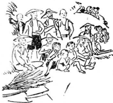
Threshing Ground Theatre