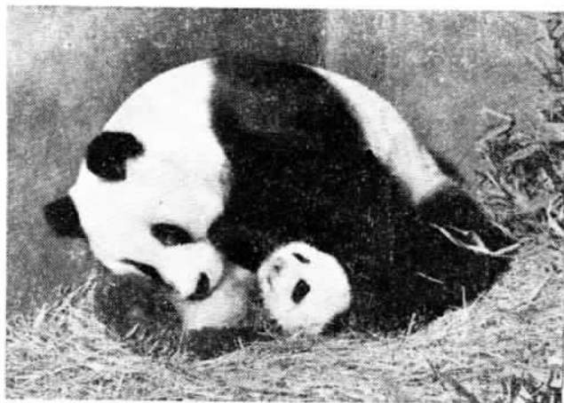
Ming Ming at three months

The mother of the baby panda was brought to the Peking Zoo in 1957, and is now more than six years old. Peking zoo keepers drew up a plan for breeding the panda in early 1963, and set up a special laboratory to study the