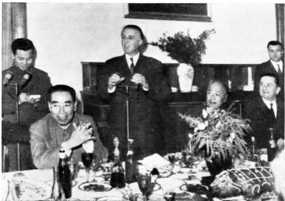
At the New Year's Eve party at the Tirana Partisans' Palace

In his speech in reply, Premier Chou En-lai, in the name of the Chinese people, extended his most cordial greetings and most sincere regards to the people of Shkoder. He praised their glorious fighting traditions in resistance to foreign aggression and their revolutionary vigilance and high morale in defending their northern frontiers and smashing the provocations and intrigues of the renegade Titoites, the special detach-