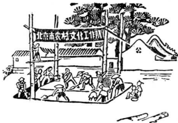
Setting Up the Stage

Before their departure, Chou Yang, Vice-Director of the Propaganda Department of the Central Committee of the Chinese Communist Party, received