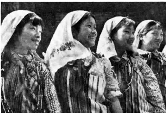
Women of the Tulung minority

PASSENGER service has been extended and flight time cut by the addition of three new through north-south airlines operated by the General Civil Aviation Administration of China (CAAC). The Peking-Shanghai run, with stopovers in Nanking and other cities, previously took six hours. On March 18 trial flights by four-engine turbo-prop airliners covered the distance in two hours and 25 minutes. Peking-Canton and Peking-Kunming voyages have been reduced by 40 per cent. The new flights will ease the passenger and freight burden on existing lines and help meet the growing demand for speedier service.