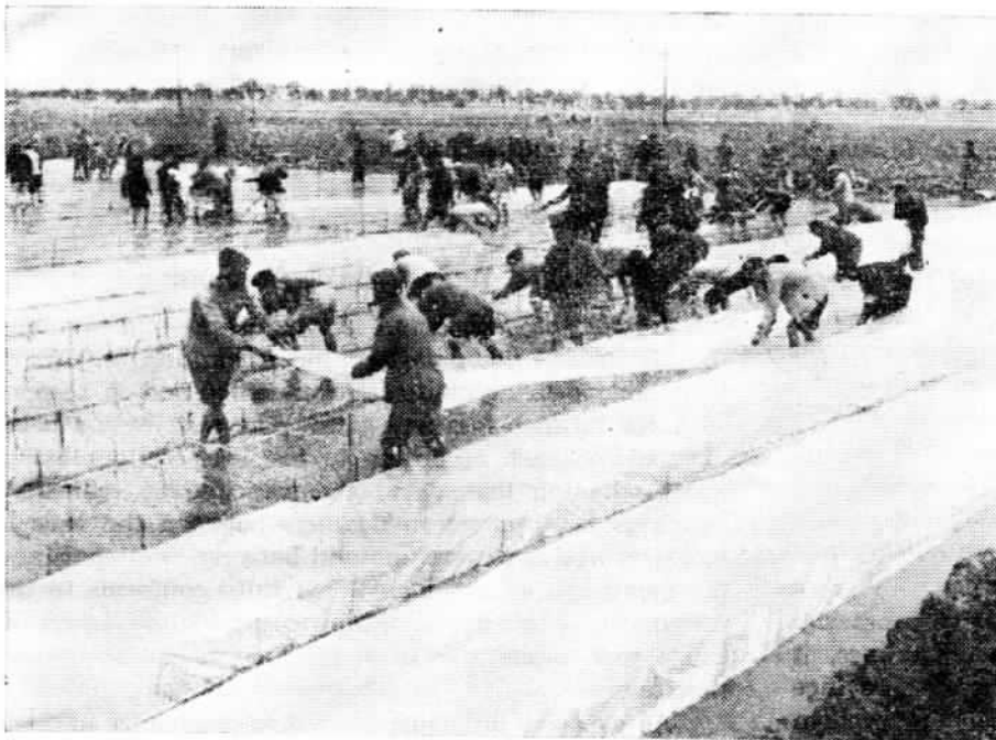
Using nylon membrane to help breed rice seedlings (Namhoi County)

missible to develop those economies at the expense of the economies of the production teams. So long as we handle these relations correctly, the collective economies of the people's communes will rapidly develop and the economies at the various levels within the communes will expand correspondingly.