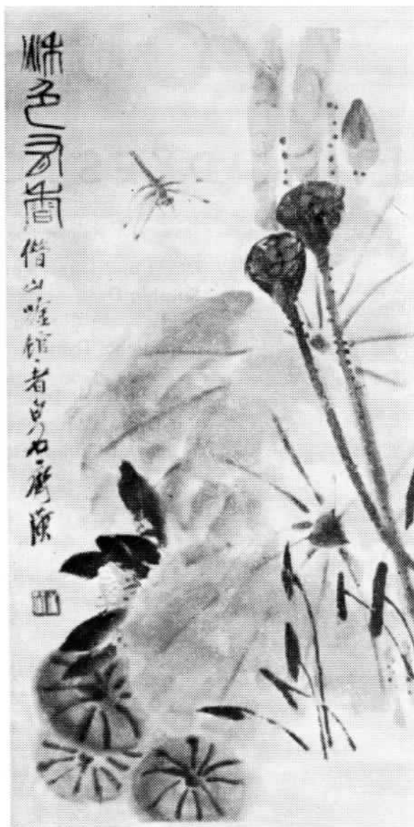
Lotus and Dragonfly

Chi Pai-shih was a tireless student not only of past masters but of nature and of everything he saw. Once when visiting a Buddhist temple, he saw white markings on the brick floor which suggested the shape of a bird. He crouched down, took out pencil and pad, and made a sketch of it. That shape later became the basis of a painting.