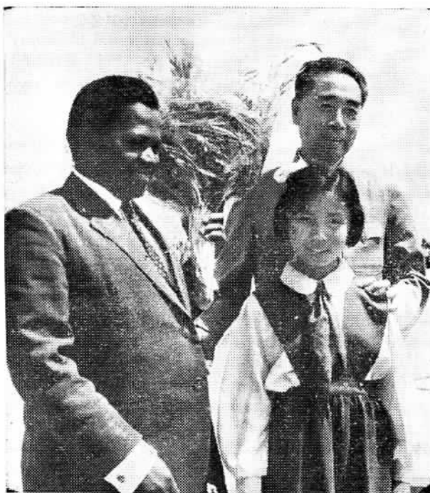
Chou En-lai and Rashidi M. Kawawa at the airport