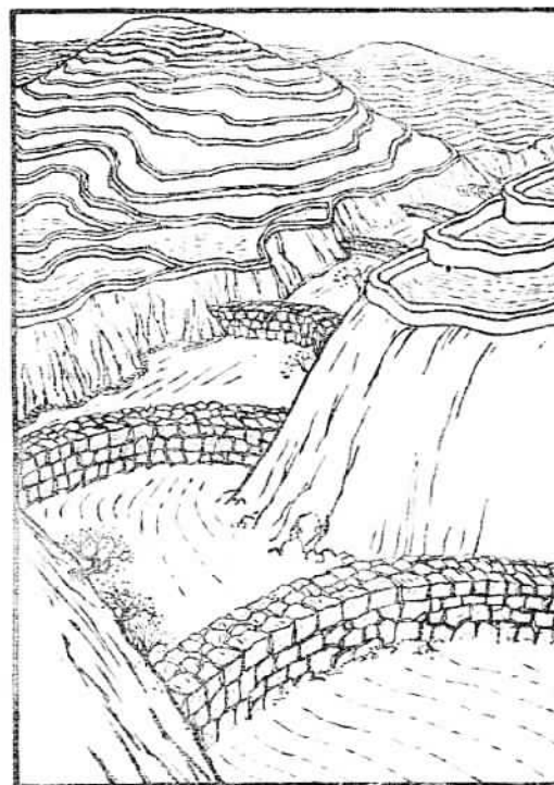
AFTER —terraced hill slopes and gullies with cheek dams to retain rainfall and soil and add to the commune's arable acreage