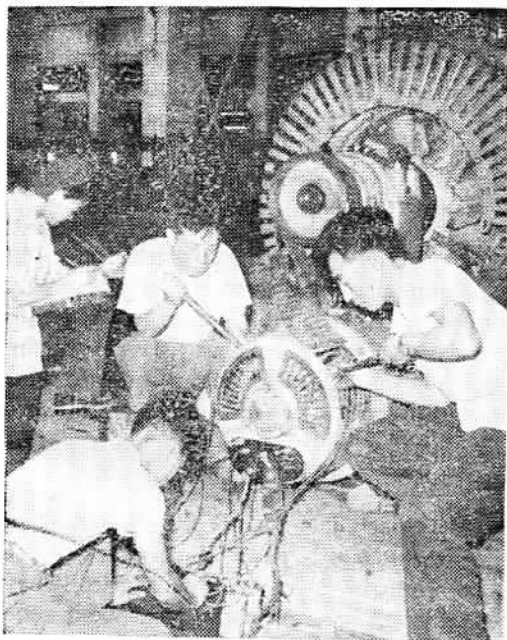
Chungking Water Turbine Plant cadres doing their stint of physical labour at an experimental station

L ONG-TERM plans for the conservation of wildlife in six major hunting areas—Chinghai, Inner Mongolia, Sinkiang, Kansu, Szechuan and Tibet—are being worked out on the basis of scientific surveys. Representatives from these