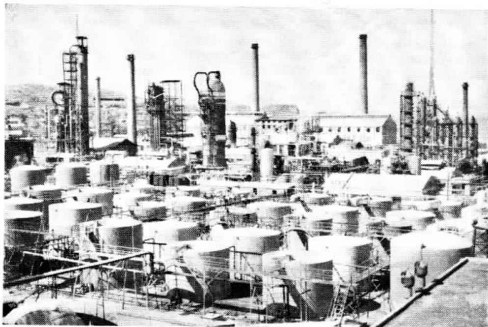
The Talién No. 7 Oil Refinery

installations but they have been more efficiently run and the quality of products has improved. The output of crude oil, gasoline, kerosene, diesel oil and lubricants has steadily increased and the state plans for these products have been consistently overfulfilled each year. In its drive for self-sufficiency, the industry is producing or has successfully trial-produced several hundred kinds of oil products ranging from those ordinarily needed in industry, agriculture, communications and transport to high-grade special products. These products are all up to the standards set by the state. In quantity, quality and range, China's oil industry today basically satisfies the needs of the various branches of the national economy. In this industry, that is so important for the national economy and defence, China stands on her own feet.