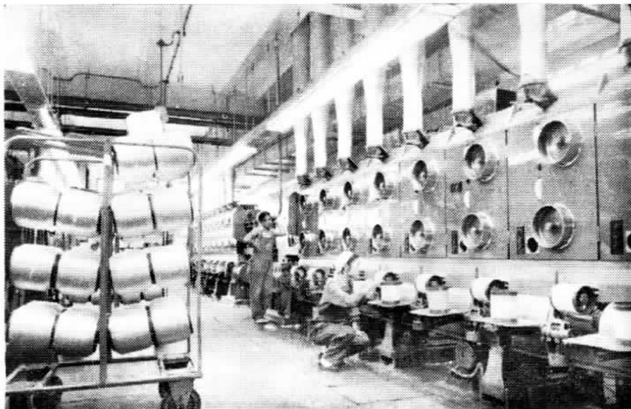
The new Peking Synthetic Fibre Plant which specializes in chintun , a variety of nylon

Bigger yields of long-staple cotton last autumn have resulted in better quality products. An analysis of several hundred samples by a national conference in April showed that the overwhelming majority of cotton goods were peak quality.