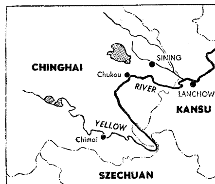
Sketch map by Su Li

A demolition party, following in the wake of the surveyors and taking