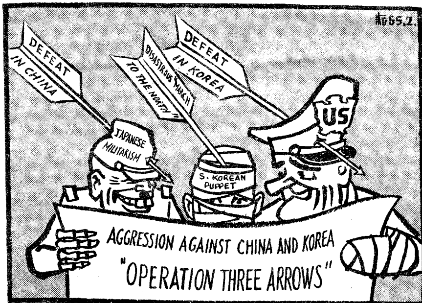
Have They Forgotten?

Marx said that certain historical facts and persons could appear twice, "the first time as a tragedy and the second as a farce." The Japanese militarists are conceited and short-sighted. During World War II, they got on their high horse and strutted about like a conquering hero for a time. In reality, however, they knew neither their own strength nor that of their adversaries. Suffering one defeat after another, they ended up in a complete fiasco and tragedy. Now, the present generation of the Japanese militarists is attempting to step into the shoes of its predecessors and go on the stage to perform. But the time now is different and the most they can do will be to act out a farce.