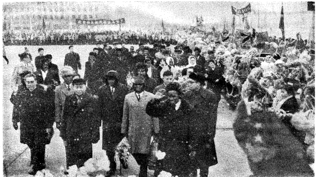
At the Peking airport. A snowfall fails to dampen the welcome by thousands for the guests from Africa

In his speech, Chairman Liu referred to the founding of a national army of Tanzania as "a matter of high significance." "The Tanzanian people," he noted, "know that without their own armed forces, a newly