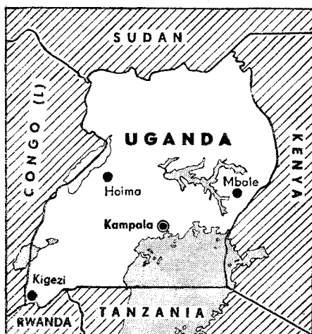
Sketch map by Su Li

He again warned imperialism and old and new colonialism: "The Indonesian armed forces are the strongest in Southeast Asia. Apart from the regular troops, we have 21