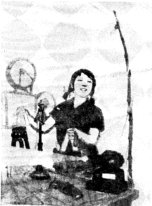
Introducing the Story Before the Film Starts

Taking Shantung Province as an example, it now has 467 mobile cinema teams touring its countryside. Each has a fixed round with certain villages picked as regular cinema-showing centres. There are 34,000