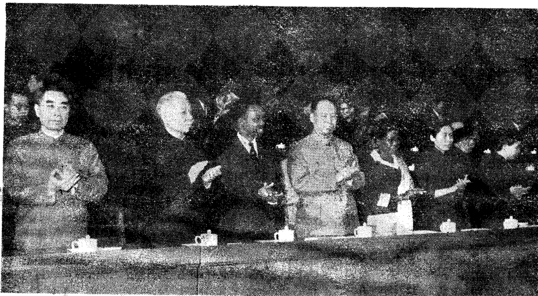
At Peking's welcome rally. From left to right: Premier Chou En-lai; Chairman Liu Shao-chi; President Nyerere; Mayor Feng Chen; Mme. Nyerere; Mme. Liu; Mme. Peng

United Republic, which is a union of Tanganyika and Zanzibar. It described the United Republic as a country with a glorious revolutionary tradition that could be traced back to the anti-colonialist struggle in Tanganyika in the late 19th century, and recalled that the Zanzibaris succeeded in overthrowing colonial and feudal rule in their 1964 armed uprising. The paper also listed the achievements of the new republic, spoke highly of its positive and active role in the international arena and its recent rebuff to the U.S. imperialists, who stopped at nothing in carrying out subversive activities in that country, a close neighbour and staunch supporter of the fighting Congo (L).