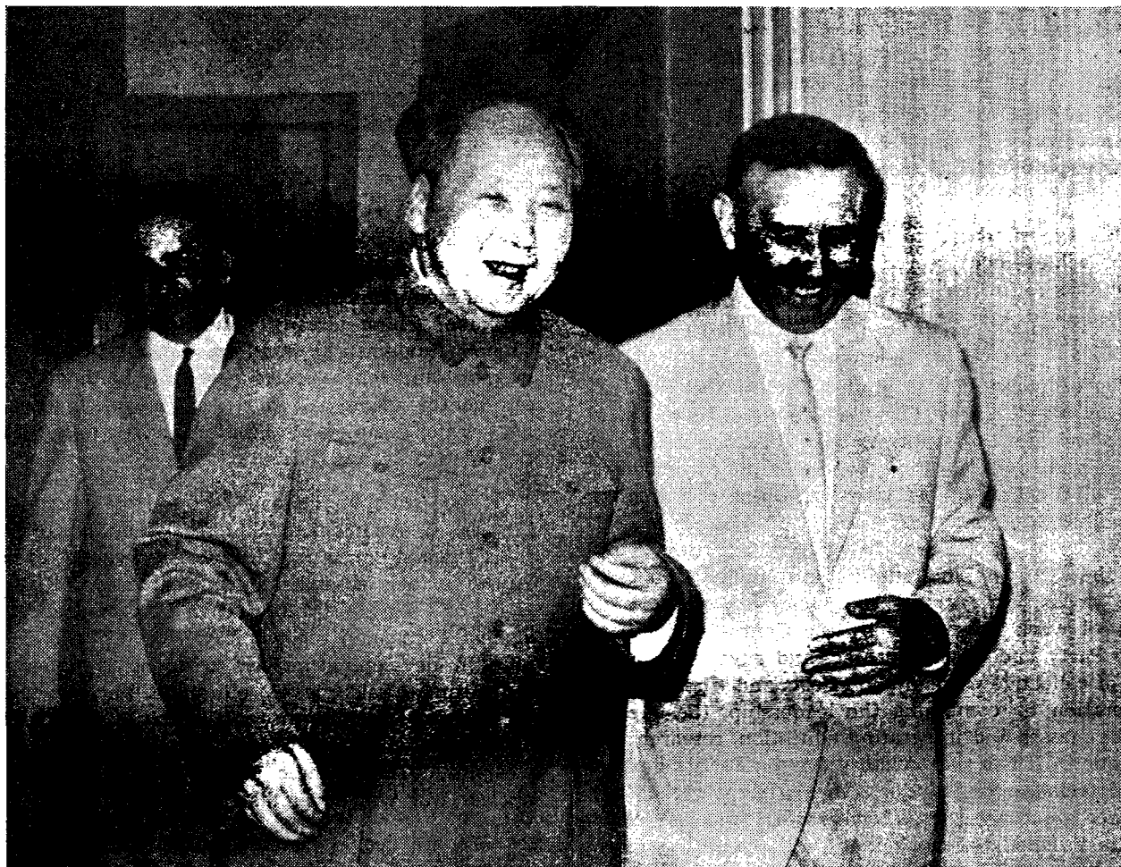
Comrade Mao Tse-tung meets Comrades Mehmet Shehu (right) and Hysni Kapo (left)