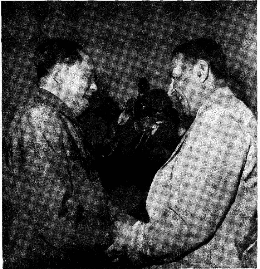
Comrade Mao Tse-tung warmly shakes hands with Comrade Mehmet Shehu

Chinese Party and state leaders held several talks with the Albanian comrades. A joint statement was signed, which was described by Chairman Shehu as an