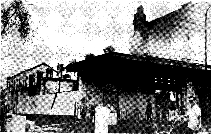
The ruined shell of the building of the General Association of Overseas Chinese Organizations in Tjimahi, West Java. It was looted and burnt by hooligans organized by the Indonesian Right-wing forces.