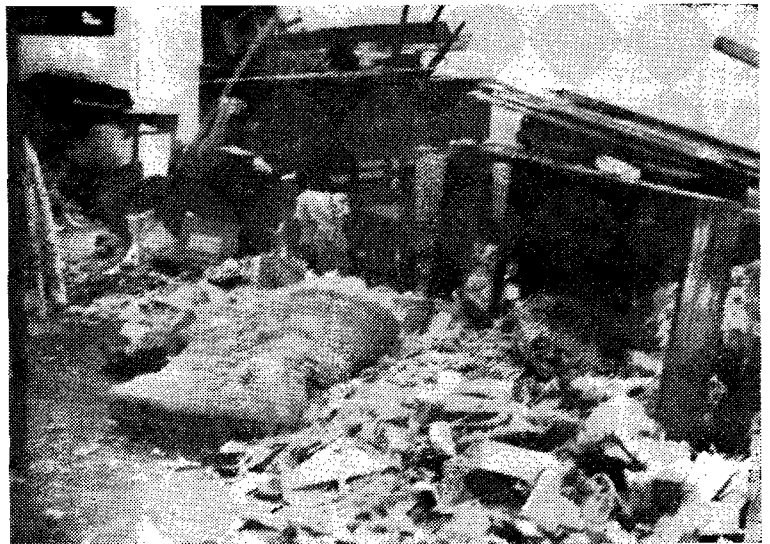
Inside the wrecked home of Yang Hung-lang, a Chinese national living in Tandjung Priok Port.