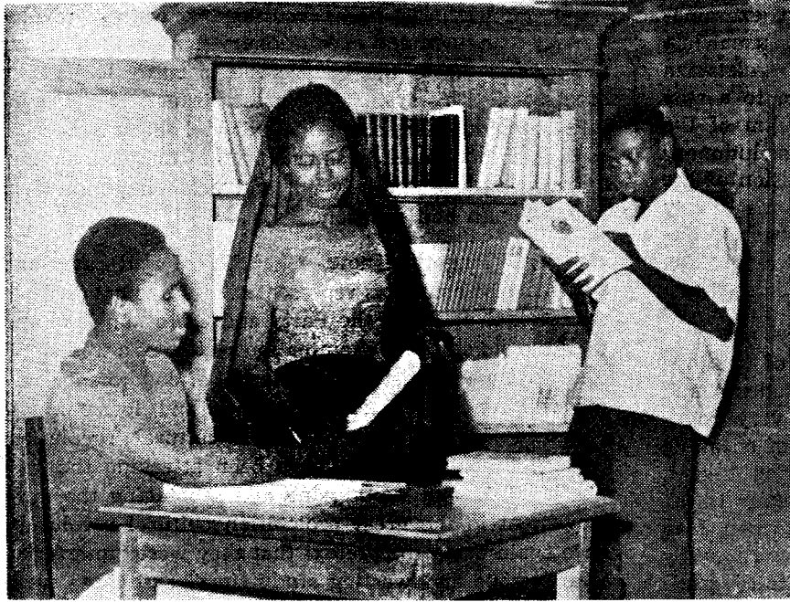
This library for young people in Zanzibar has many revolutionary books. The most popular among them are the works of Chairman Mao

After the independence of Algeria, articles on the study of Chairman Mao Tse-tung's thought often appeared in the press. His works were spread more widely, and more people studied them. Thousands upon thousands of copies of Chairman Mao's works have already been sold in Algeria.