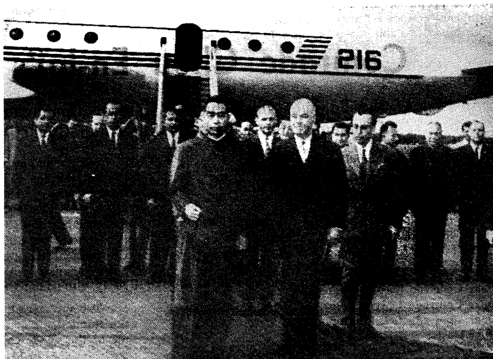
Comrade Chou En-lai (left) and Comrade I.G. Maurer at the Bucharest airport

The Rumanian people, Comrade Chou En-lai added, have opposed control and interference from outside,