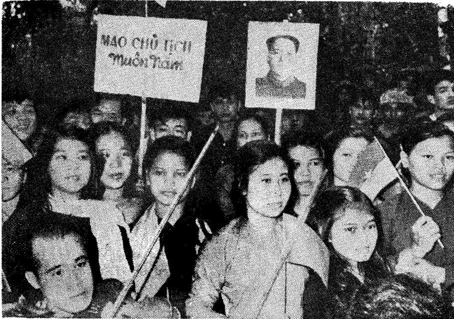
Carrying portraits of Chairman Mao and slogans reading "Long live Chairman Mao," young people of the liberated areas in south Vietnam welcome a visiting Chinese journalists' delegation.

fighting hamlets. Relating her experience in struggle, a woman cadre told us how back in 1961 she and her comrades had planned to get rid of the "strategic hamlets" when they were being set up everywhere by the enemy. She had attended an important conference to study instructions and discuss plans for action. During the conference, she drew inspiration from a study of the "Report on an Investigation of the Peasant Movement in Hunan" in the Selected Works of Mao Tse-tung . She said, "I paid special attention to the question of mobilizing and arming the peasants." She and her comrades had later led the peasant masses in actively unfolding a movement for the demolition of the "strategic hamlets" in a coastal province and had won remarkable victories. She told us with deep